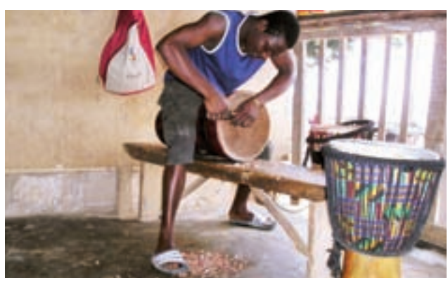
Drum producer of the cooperative Kalangu in Accra, Ghana. Foto made during a study visit of Czech NGOs to Fair Trade cooperatives in Ghana.

TRIALOG has contributed a lot to enhance the NGO capacities in the new EU member states and has facilitated and strengthened contacts between new and old