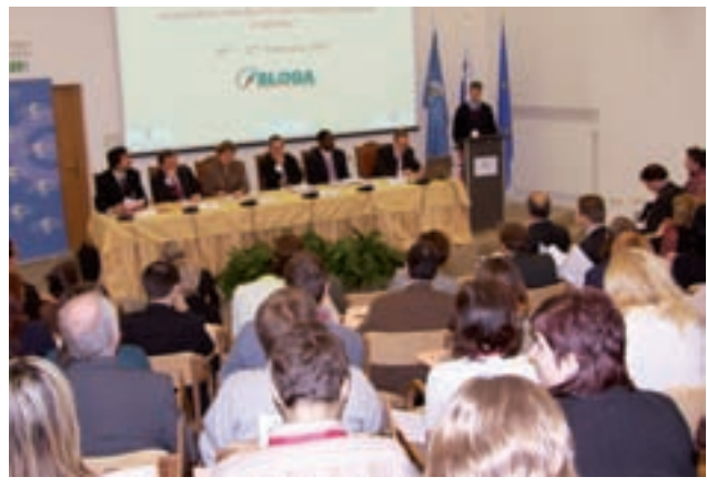
International SLOGA Conference on the Western Balkans, February 2007

develop a European framework for development education and awareness raising. As a result, the European strategy on development education was presented during the Portuguese presidency. In close cooperation