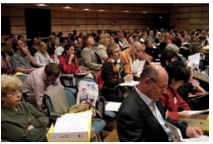
Plenum at the Development Education Partnership Fair

The result was a strong participation of NMS organizations in the two-stage ED Call. According to EC data, 63 concept notes were submitted by the 10 eligible NMS – Bulgaria and Romania were not yet eligible. In May 2007 the EC invited 38 preselected projects from NMS to submit full proposals. During 4 trainings in Ljubljana, Prague, Warsaw and Bratislava TRIALOG supported 50 participant NGOs from old