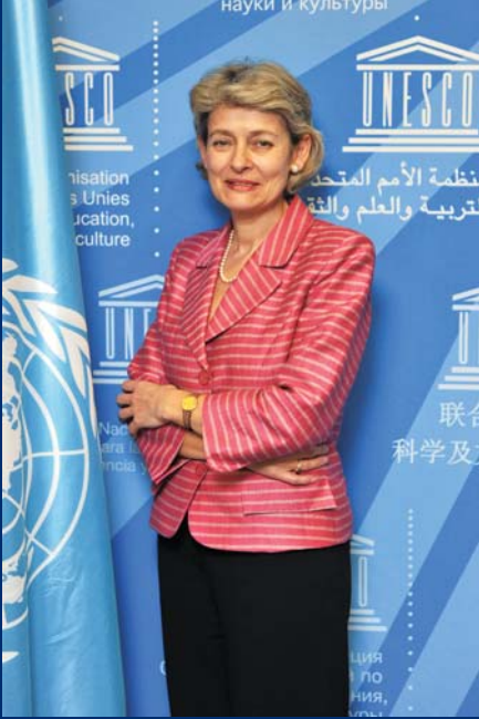
Irina Bokova, Director General, UNESCO

“Education is what gives individuals the knowledge and values to live in dignity and act for the common good. This is why it is the most basic foundation for building lasting peace and sustainable development.”