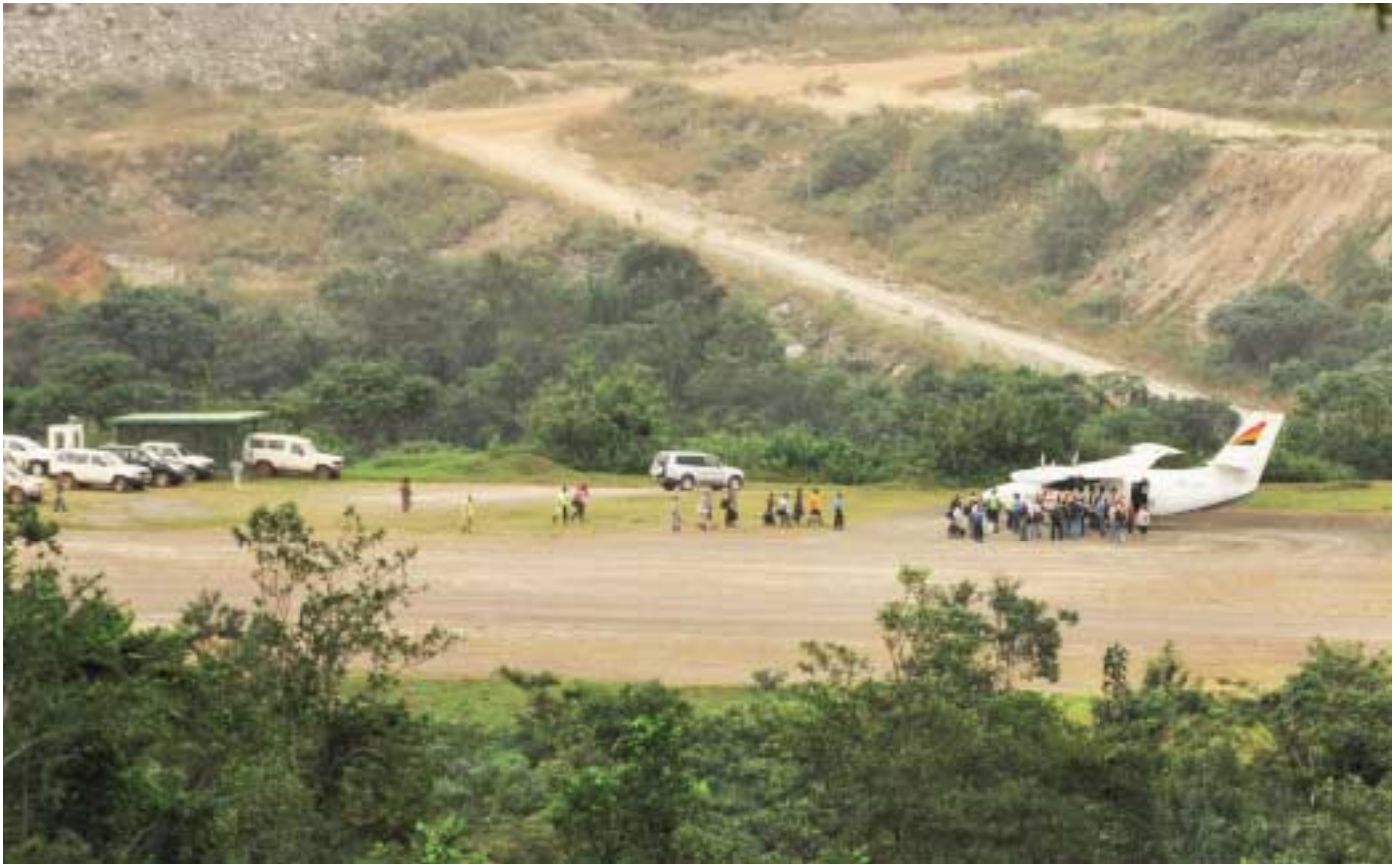
AngloGold Ashanti has its own runway in connection with the mine. From here Ghana's gold is transported out of the country to a gold refinery in South Africa.