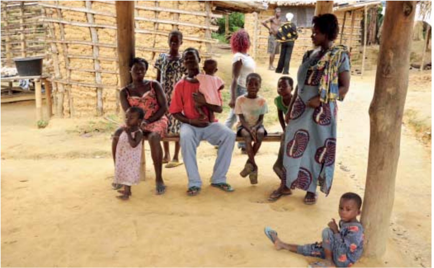
These local farmers have themselves rebuilt their village after the mining company Anglo Gold Ashanti flattened the earth.

Like the majority of African countries Ghana offers mining corporations' tax advantages. They are exempted from duties, for example on fuel and the import of machines, they pay a lower tax percentage, and they can reduce their tax base through special deductions. These advantageous conditions are established to attract foreign investments to an industry arked by considerable fluctuations in the price of metals, large expenses linked to exploration and creation of new mines, and - specific for mining operations in Africa - political and economic instability. Mining corporations naturally avail themselves of the tax incentives they are offered by Ghana in an attempt to attract foreign investors to the mining sector. But through aggressive tax planning these corporations further diminish their tax payments.