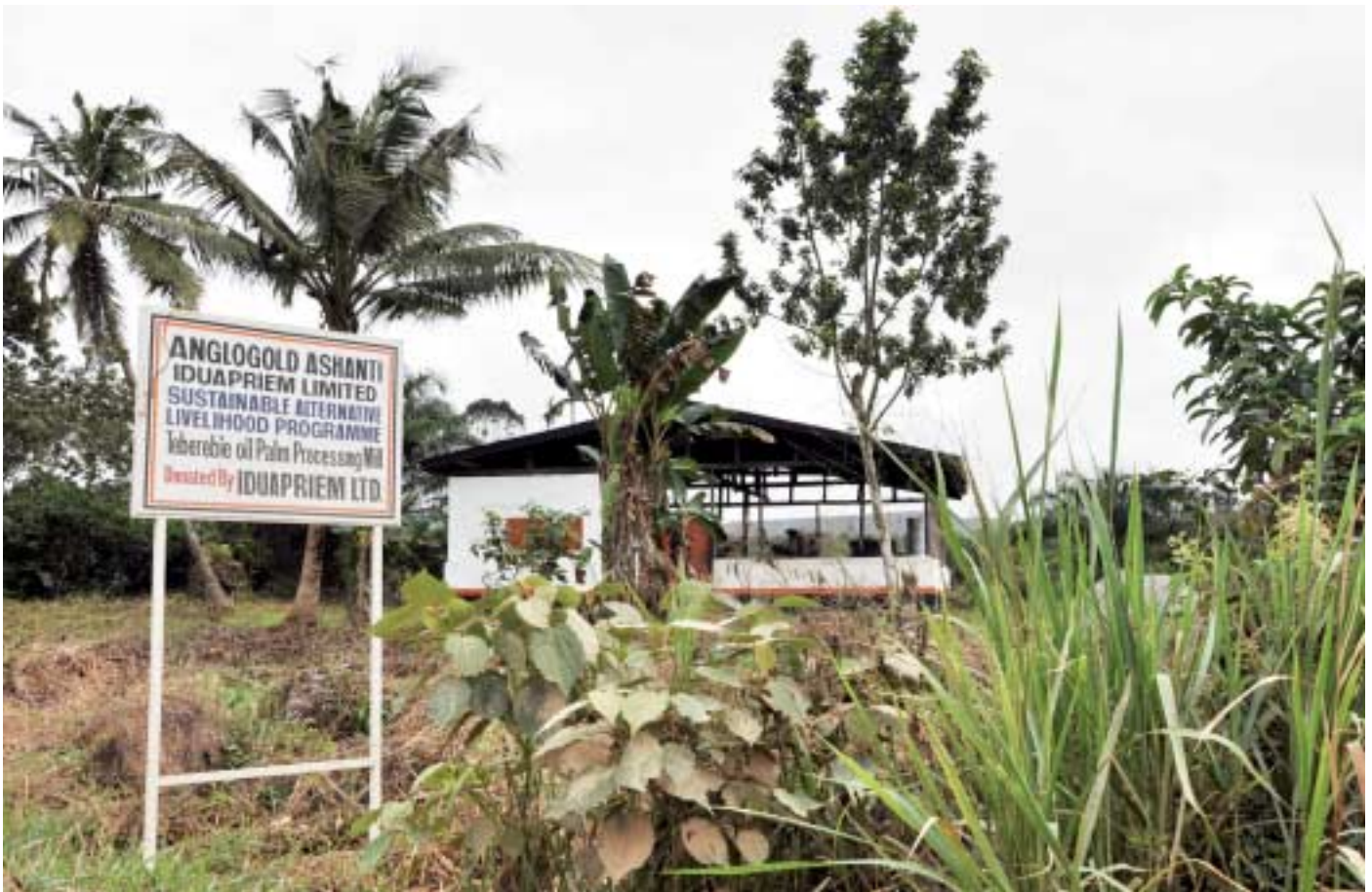
With projects like this mill, mining corporations attempt to compensate the communities for among other things the loss of farm land; but in Tarkwa the local farmers are not content.

Transfer mispricing is illegal, but it is difficult for African tax authorities to control these dealings. In part because it is highly resource demanding to cross check the mining corporations' declarations of income and expenses and in part because it is difficult to estimate the real prices of specialized equipment.