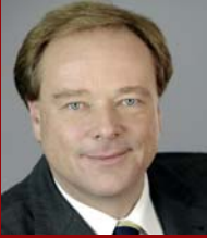
Minister Dirk Niebel

”Development cooperation is about giving people the freedom to shape their own lives and to build a bright future for their children, by making their own decisions and taking responsibility for them, without suffering material hardship.