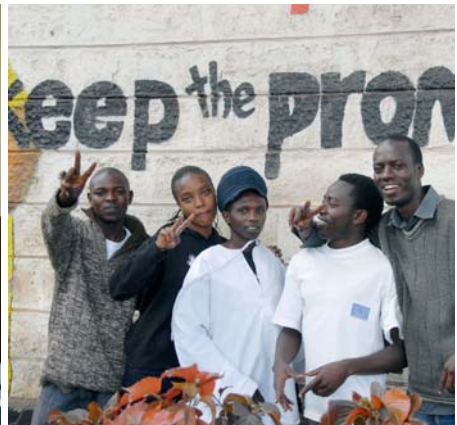
Early childhood health care and AIDS education for young people in Kenya