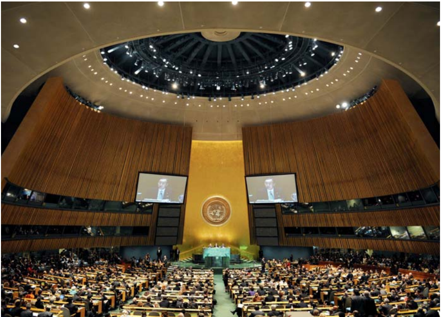
General Assembly Hall of the United Nations, New York

International organisations and the European Union are funded by their member countries. Through Germany's membership of such organisations as the United Nations, the World Bank Group, the International Monetary Fund (IMF) and the regional development banks, the BMZ is able to influence their policies. One focus of the BMZ's work is to improve the effectiveness and efficiency of international organisations.