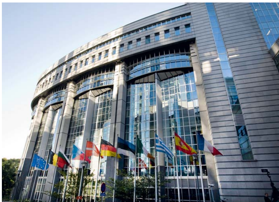
European Parliament, Brussels

The EU shares responsibility in the development field with its member states and complements their policies.