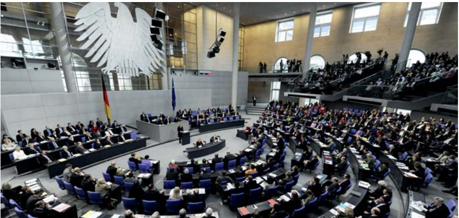
The debating chamber of the Bundestag, Berlin

The Development Ministry plays an active role in international negotiations and second members of staff to work in international organisations and in partner countries. Within Germany, the BMZ supports the general public, non-governmental organisations, churches, foundations and businesses in their efforts in the development field. The Ministry's work is scrutinised by the Bundestag, the Lower House of the German parliament. The Bundestag Committee on Economic Cooperation and Development has special responsibility for this particular area of policy.