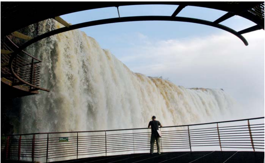
Energy from water, Brazil

And, not least, development policy helps preserve world peace and stability. So development policy is informed by both our values and our interests.