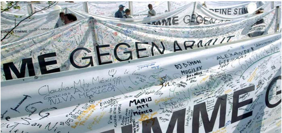
The "Your Voice Against Poverty" campaign in front of the parliament building in Berlin

The BMZ gives these NGOs financial support for their development activities, provided those activities are in line with the basic principles governing German development policy. The government exercises no influence over the NGOs' aims or policies. These organisations' independent status enables them to operate in countries and regions where there is limited scope for official development cooperation.