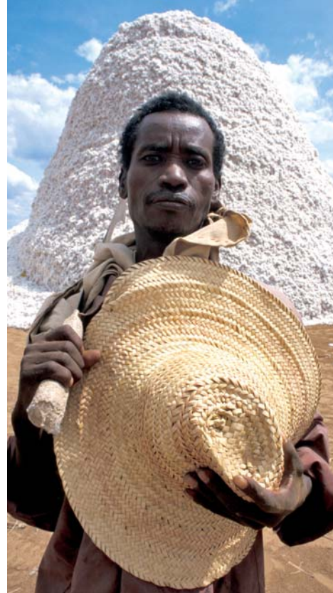
Cotton picker in Ethiopia

German development policy is informed by the humanistic principles we hold. We are committed to realising freedom, human rights and solidarity within and between societies. That is similar to Germany's experience following World War II. The Marshall Plan that was drawn up for West Germany laid the foundations for the prosperity we enjoy today.