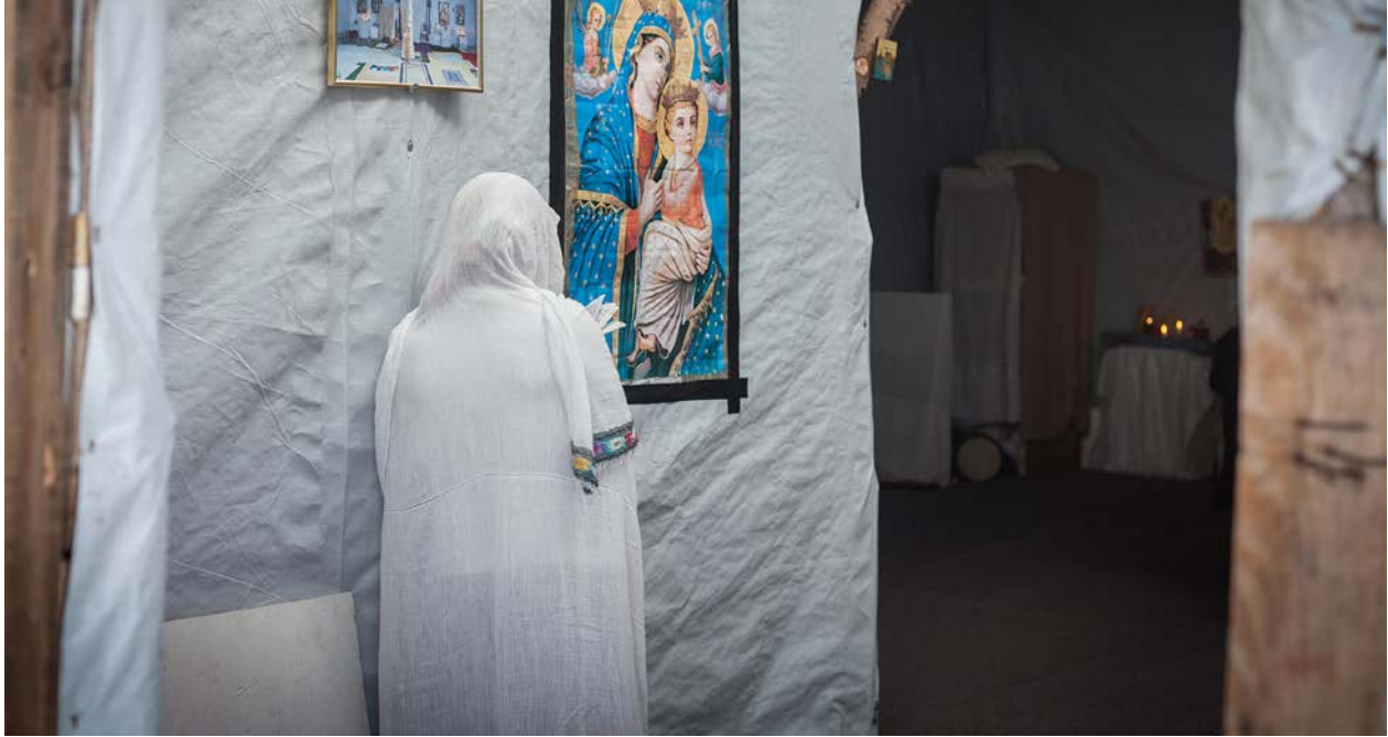
Woman at the entrance of the Eritrean Orthodox church.

Creative projects aimed to highlight the talent, skills and humanity of those living in the camp. These included: