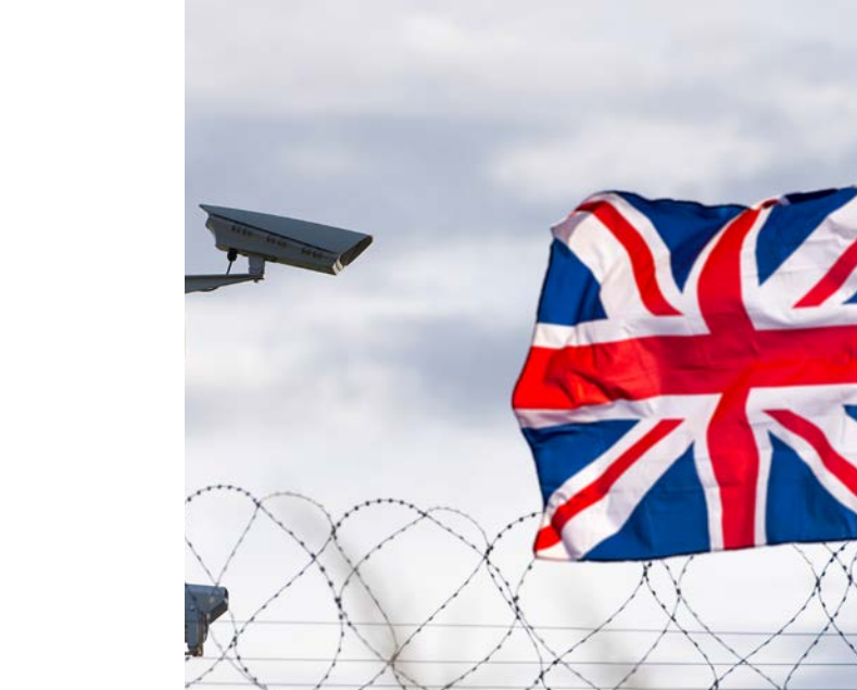
British Flag behind wire fence and surveillance technology.

However, rather than these policies having the stated effect of preventing people from arriving or settling in the area, they have simply resulted in worsening living conditions and restricted access to protection for the many migrants who continue to arrive there irrespective of the government strategy.