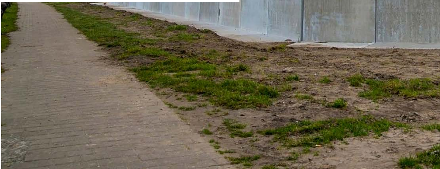
The Wall of Calais.

The externalisation and heavy securitisation of the UK's border, begun in the 1990s, and the UK's unwillingness to grant individuals access to its asylum system, has led to the creation of a bottleneck for displaced people in northern France wishing to reach the UK. In tandem, and indeed partly financed by the UK government, French police are tasked with policing and uprooting communities in order to prevent so-called 'fixation points' along the coast. Under the same policy, minimal state intervention providing access to services has been seen over the decades.