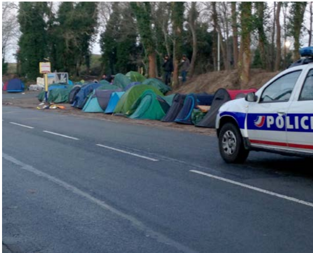
Police vehicle in front of an informal settlement by a roadside.

RRE's research findings from another study twelve months on from the demolition of the camp, based on 233 surveys, suggested that a staggering 91.8% had experienced police violence. This was an even higher percentage than during the time of the Calais camp (75.9%) and during RRE's aforementioned research in April 2017 (89.2%). Of these respondents, 50.5% said that the violence had taken the form of physical violence, while 23.1% described it as verbal abuse and 90.1% tear gas or pepper spray. 111