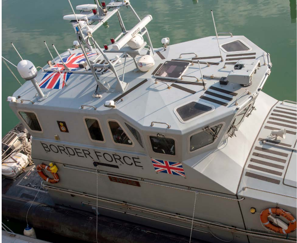
UK Border force vessel.

This approach taken by both the UK and French Governments in response to displaced people arriving in northern France to reach the UK is costly, ineffective and unsustainable. Rather than acknowledging the root causes that drive people into dangerous migration routes – of which Britain’s own border securitisation policies 138 have been shown to form an integral part – the UK Home Office has continued the counter-productive and, indeed, deadly approach that has defined much of its own domestic immigration policy: deterrence, surveillance and removal.