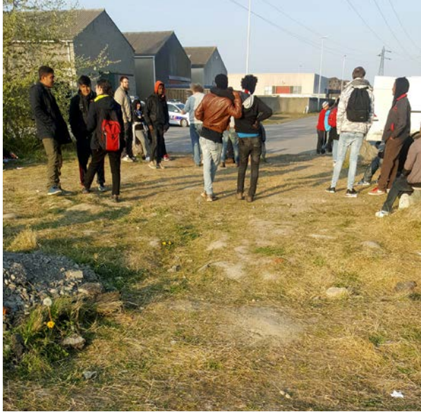
Young people and volunteers during food distribution in 2017.

One year later, in autumn 2019, Natacha Bouchart announced a ban on food distribution in the region yet again, forcing organisations to stop the essential provision of nutrition to refugees and displaced people in the area. The ban was later suspended when found to be illegal by a tribunal in Lille. 86