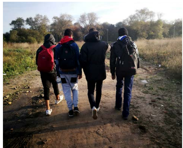
A group of minors left in the "Jungle" during the eviction.

residents and volunteers would carry with them what they built and learnt in this space. Many would proceed to form inspiring projects, businesses and initiatives in France, the UK, Greece, the Balkan Route and worldwide – an unmeasurable ripple effect of empowerment, persistence and commitment to the human rights of displaced people in Europe.