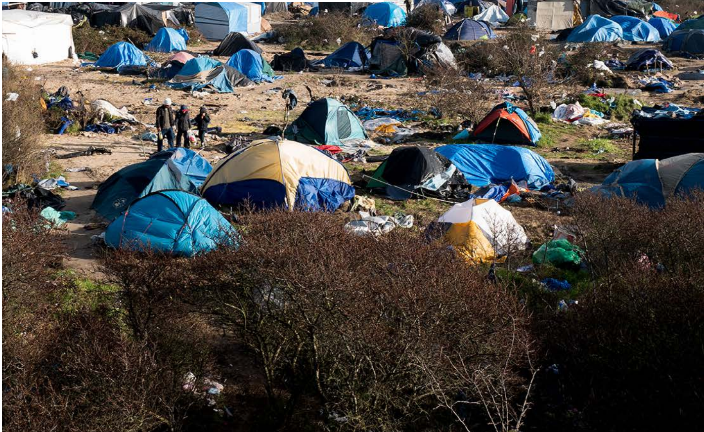
The "dunes" on the edge of the Calais camp.

With more and more people arriving at the approximately 18-hectare site, an uneven sandy former landfill site in an industrial zone in Calais, and in the striking absence of adequate state provisions, large numbers of individuals soon found themselves in deplorable conditions at the new camp site.