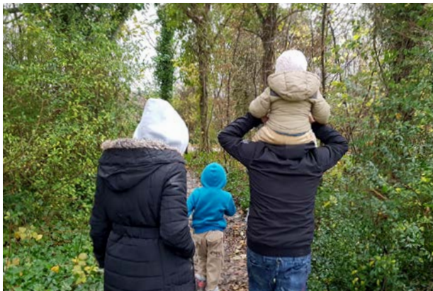
A family with young children in the woods in northern France.