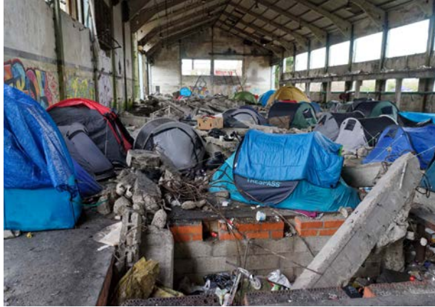
One of the informal settlements in northern France.

By mid-January 2017, organisations on the ground estimated that the number of displaced people in the area had reached between 500 and 1,000 people, many of whom were thought to be unaccompanied minors. Throughout the year, the number would remain relatively stable at around 1,000-2,000 people, despite the