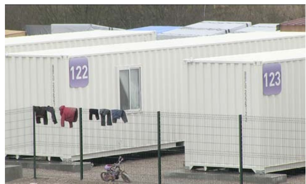
Container accommodation.

The nature of overcrowded space filled with flammable materials in close proximity to gas bottles and bonfires made fast spreading fire an ever-present risk in the camp. While volunteers were trained in basic fire response and water points and a "volunteer fire vehicle" were set up, this risk was never fully contained and fires devastated considerable areas of the camp during the year.