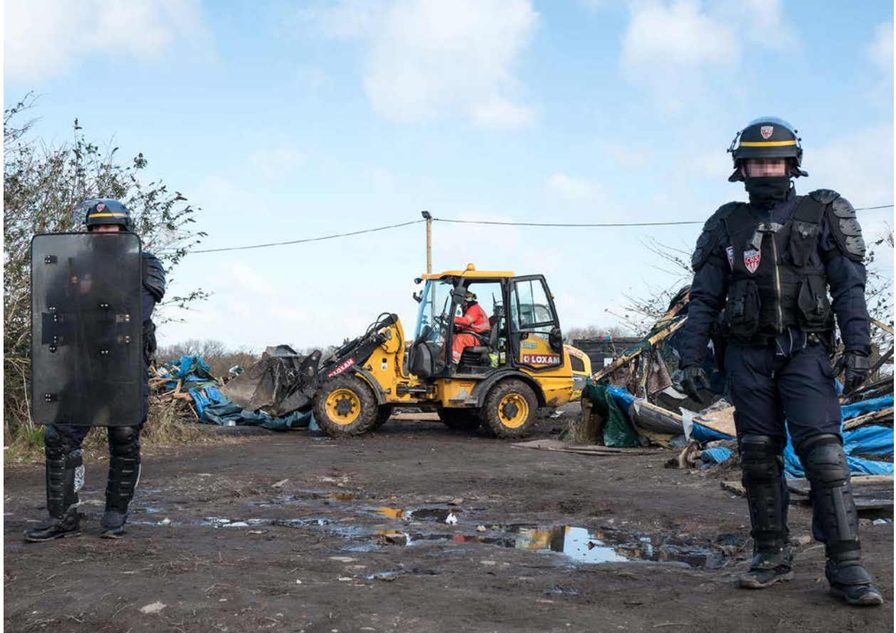
CRS presence during an eviction.

Amidst a burning camp, hundreds of children were sent to the container camp, where they stayed until being taken to the Centres d'Accueil et d'Orientation pour Mineurs Isolés Étrangers (CAOMIEs) one week after everyone else had left. There was no running water for the children, and a complete absence of official safeguarding measures. Refugee Youth Service and other organisations deplored the abhorrent safeguarding gaps during the eviction: "Daily dangers to children ranged from poor sanitation conditions; food insecurity; poor access to health care, legal advice and information along with exposure to sexual exploitation and abuse, human trafficking and being subject to police violence." 77 The specific facilities for accessing the asylum claim procedure (outreach by official organisations, including OFPRA (France's Office for the Protection of Refugees and Stateless Persons), and departures by bus to reception centres) were discontinued.