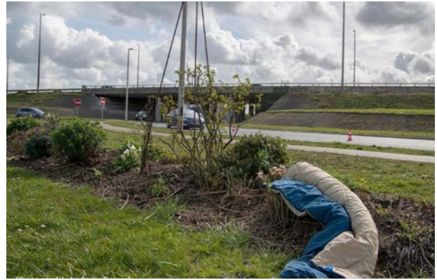
Sleeping bag by a road.

In sum, the high risk of arrest in the case of non-compliance, the lack of accessible and reliable information regarding the destination of these buses, as well as the absence of individualised accommodation options, are some of reasons this type of sheltering operation is often termed as precisely 'forced'. The parameters of such an operation disregard the consent of the people concerned, and rather than provide adequate and appropriate accommodation, are mostly used as a way to disperse and remove people from the border area. This system is also used as a political tool to portray the French state in a better light: simultaneously 'solving' the problem of people staying at the UK-France border, as well as supposedly ensuring their access to shelter. However, the evictions and accompanying forced sheltering operations remain ineffective since the dispersed people tend to simply return shortly thereafter. Indeed, it is to be noted that the practice of continuous evictions and dismantling operations does not appear to prevent the emergence of informal settlements in the area; instead, the result has been that many individuals and communities have simply returned a few days later, while others have been driven to new sleeping spots and into further hiding. Others yet again have set up camp in places such as Steenvoorde, Angres, Norrent-Fontes, and Tatinghem – whilst some have found their way into the town centre of Calais, finding temporary shelter under bridges.