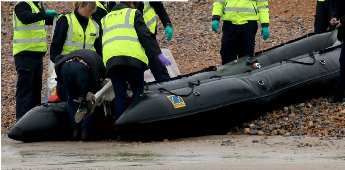
UK authorities inspecting a dinghy on the Kent shore.