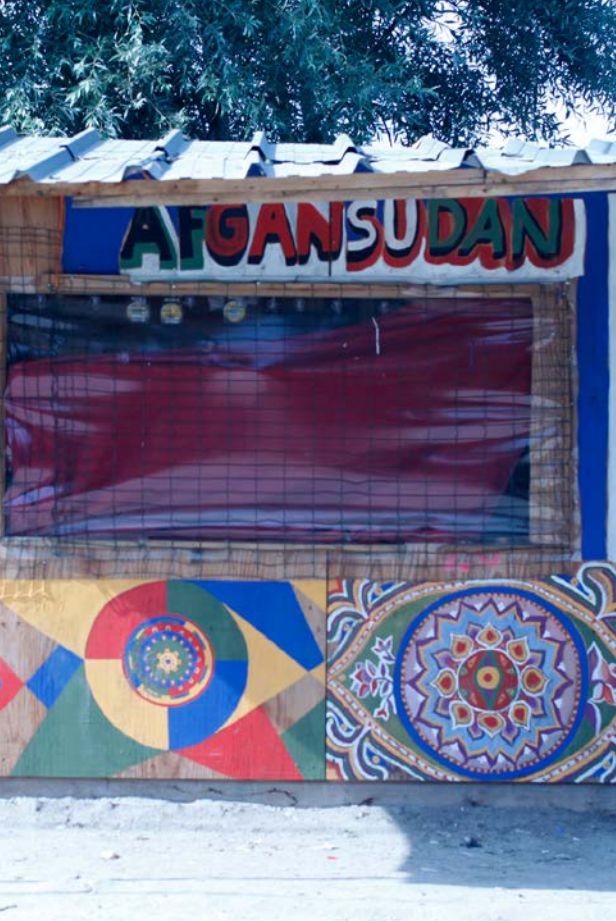
One of the many restaurants.