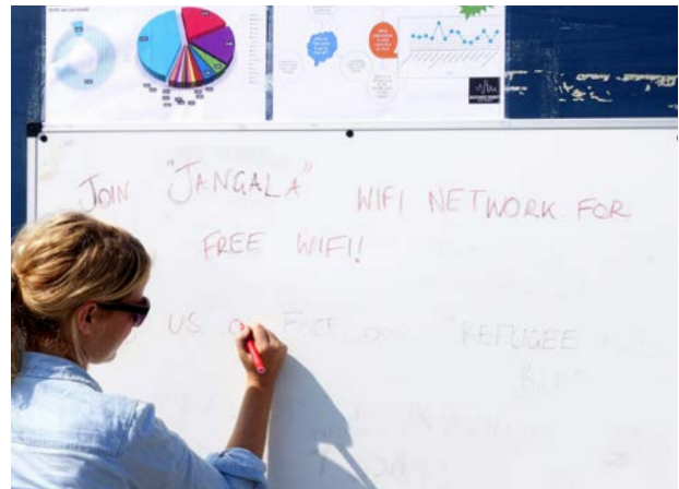
A volunteer facilitates an info session at the Refugee Info Bus.

The research found that women were deeply concerned about facing sexual exploitation, particularly at the hands of people-smugglers. Given these risks, it was of great concern that the majority of women were not able to lock their shelter securely at night. Another main point of concern was the provision made for women's reproductive health, a fundamental right of all women and girls, in the camp. While Gynecology without Borders offered some access to specialised support, the overall access to reproductive health services remained substandard.