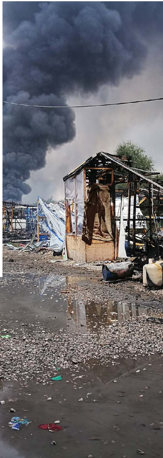
The camp on fire.

Recalling the fires during the eviction of the southern part of the camp just months before, some volunteers and camp residents trained themselves in rudimentary fire response, whilst water points were set up across the camp in preparation for the looming demolition.