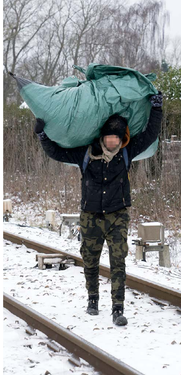
A displaced person moving their belongings.

Other groups, including Human Rights Observers, frequently highlighted shortcomings around sanitation and hygiene and, particularly, waste disposal; for instance: