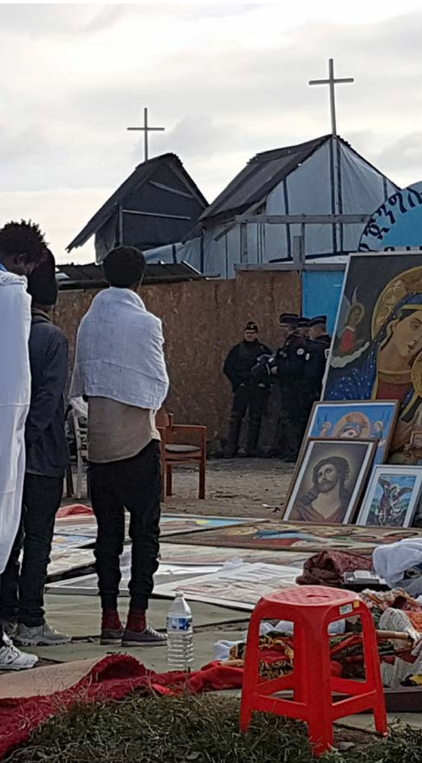
A group of former residents congregate in front of the church before its final demolition.

While the history of the Calais camp and its eviction is a shameful legacy for both British and French authorities, many former camp