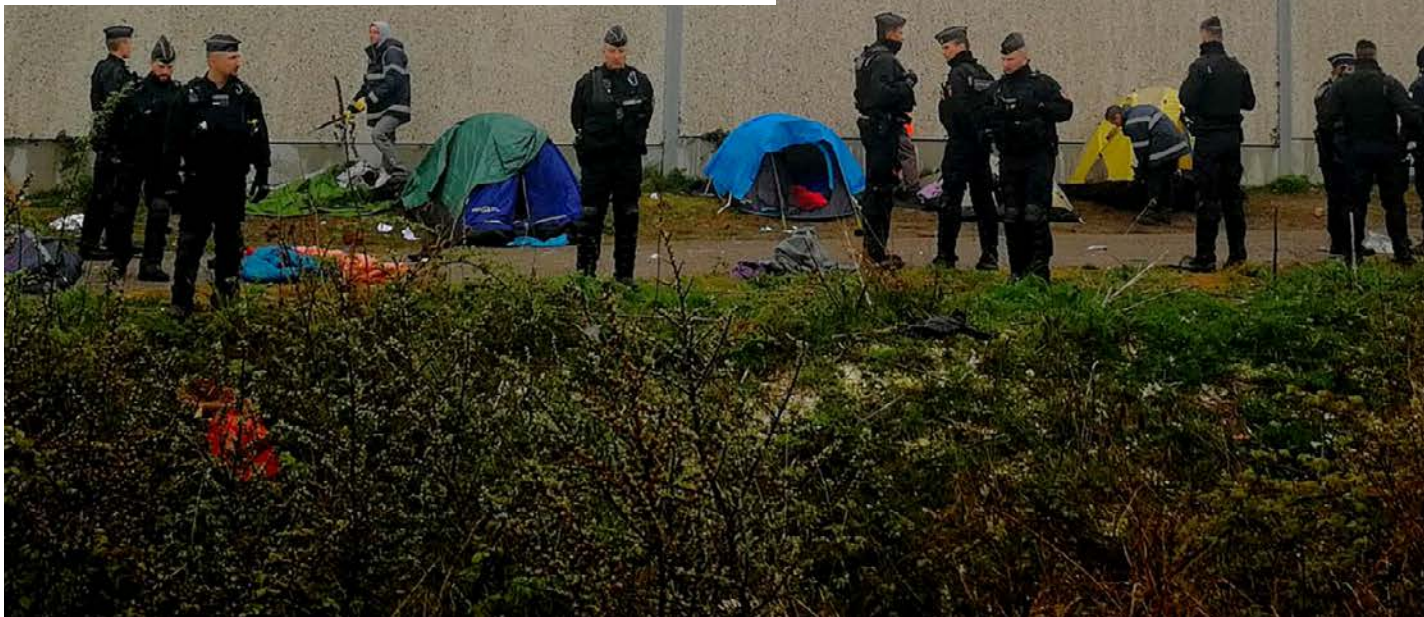
CRS during one of the many evictions.

Individuals who had left on their own initiative in the lead-up to the clearance of the camp, and many of those who had been removed by state authorities to reception centres across France, soon started reappearing in the northern France area. People were now doomed to survive without even the most basic of infrastructures of the 'Jungle' camp, left to sleep rough and hide away in industrial zones or wastelands, in the outskirts of towns, in forests and woodlands, and under bridges. 81