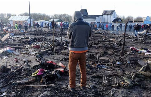
A young person in the ruins of the newly demolished south side of the camp.

During 2016, the British peer and former child refugee Lord Alf Dubs led calls within the British parliament to legislate for children in the 'Jungle' to be relocated to the UK. A reworded version of the motion known as the Dubs Amendment – originally stipulating the relocation of 3,000 children but, having been defeated by the Conservative government despite support from all opposition parties, now applying to an unspecified "specific number" of children 63 – was accepted by then-Prime Minister David Cameron before it went to vote in the Commons a second time. Less than a year after it opened, the Government closed the scheme having brought just 350 unaccompanied children to the UK from refugee camps in Europe. This, then-Immigration Minister Robert Goodwill said, met the "intention and spirit" of Lord Dubs' amendment – a statement Lord Dubs disagreed strongly with. 64 The closure of the scheme was condemned by NGOs, faith leaders and politicians of all colours. 65 A few months later, facing litigation from the charity Help