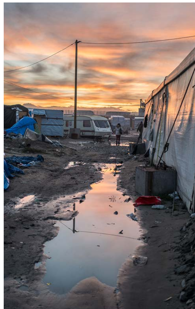
Sunset over the Calais 'Jungle'.

This, however, was to change quickly following evictions of parts of the camp and the subsequent continuous police blockade of building material entering the camp (see p.19 below).