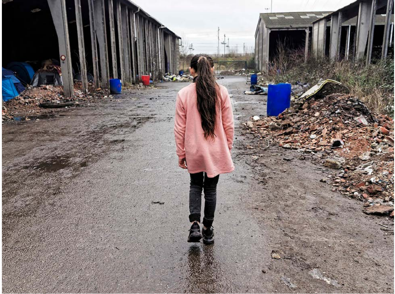
A girl in an informal settlement in La Linière.

Despite the surge of vulnerable refugee children returning to northern France following the demolition of the Jungle camp, then-UK Home Secretary Amber Rudd announced the end of the 'Dubs Scheme' in February 2017 after only 350 children had entered the UK through the procedure. 126 This would be the beginning of a long legal and political struggle: