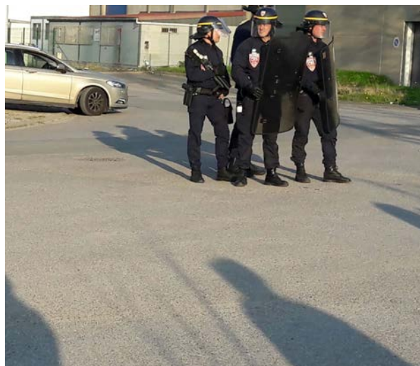
Police presence during food distribution in 2017, a situation which soon escalated into violence.

In addition, a noteworthy shift in 2020–2021 compared to previous years was the increased occurrence of forced sheltering operations as an integral part of larger-scale evictions. As detailed in the 2020 HRO annual report, in addition to the already coercive practice that is the destruction of living spaces and possessions, during sheltering operations people are often surrounded by police and forced onto buses, and subsequently taken to reception and examination centres (centres d'accueil et d'examen des situations, CAES). In such situations, refusal to get onto these buses can result in an arrest. One of the biggest forced sheltering operations took place on the