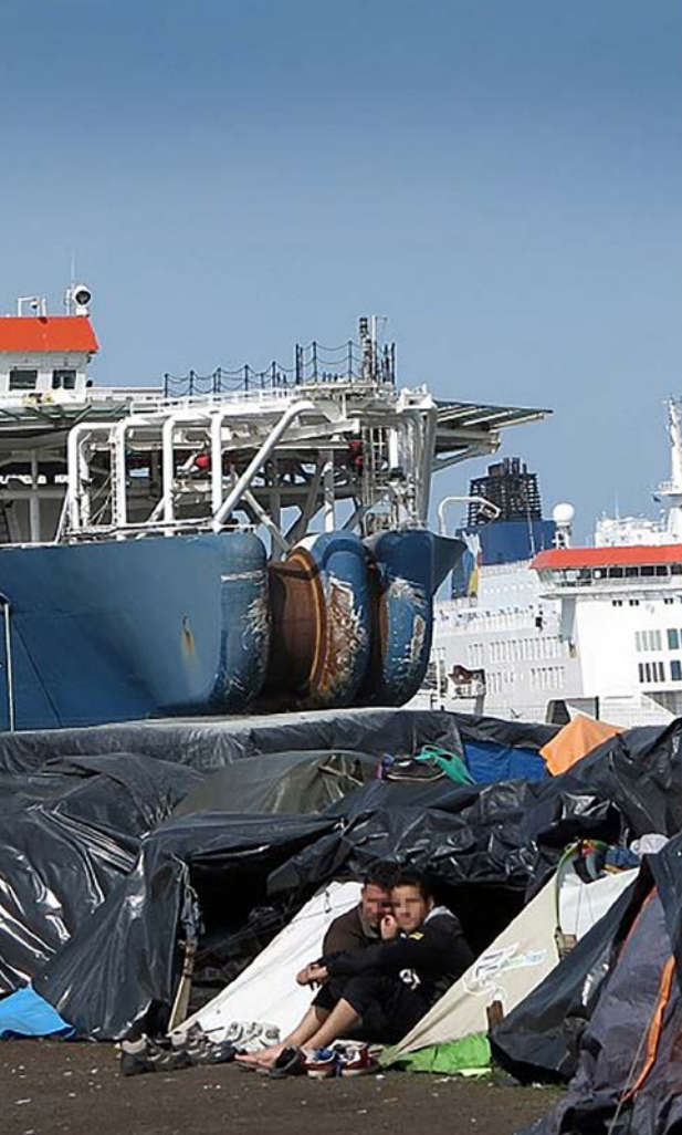
One of the early 'Jungles' by the ferry port.

In December 2014, the UNHCR reported that there were 2,500 displaced people in the area, compared to around 500 during previous winters. The majority were from countries affected by civil unrest or war, such as Somalia, Sudan, Eritrea, and Syria. 12 Most people were sleeping in improvised shelters tucked away in the woodlands, or on abandoned industrial sites and wastelands. Others found shelter in squats or buildings rented by the No Borders activists, whilst others set up tents in the town of Calais, or were hosted by citizens of Calais. 13 The European director of UNHCR described the situation in Calais with the following words: "The conditions are totally unacceptable and are not consistent with the kind of values that a democratic society should have" . 14