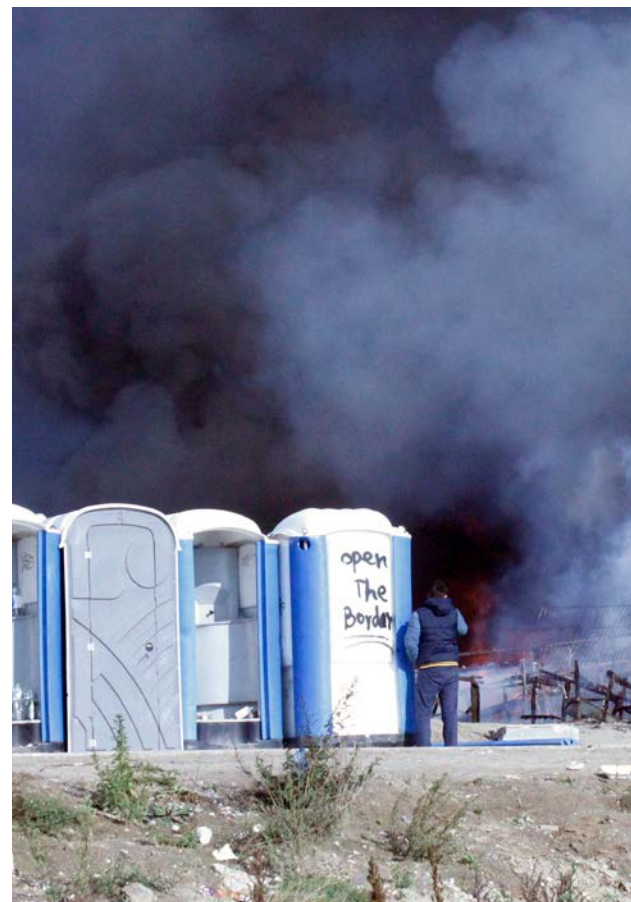
The "Jungle" burning.