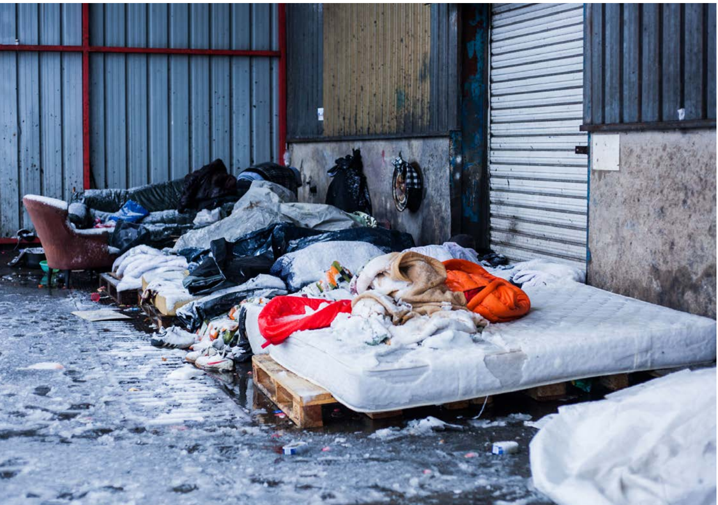
Informal settlement in front of a warehouse during winter.