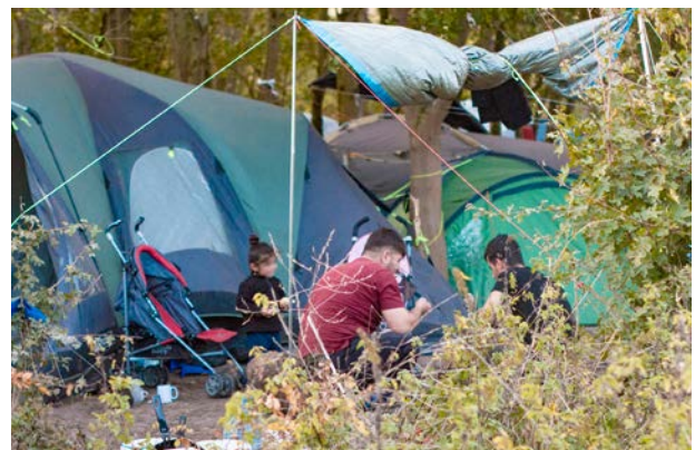
Children in an informal settlement.