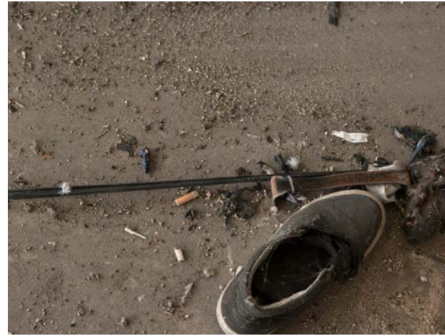
A shoe left behind in an informal settlement.

Throughout the post-Jungle camp years, organisations and watchdogs have consistently highlighted this trend of police violence, including but not limited to the following: