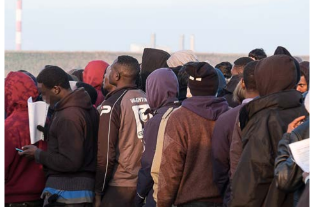
Camp residents on eviction day queuing to board the busses.