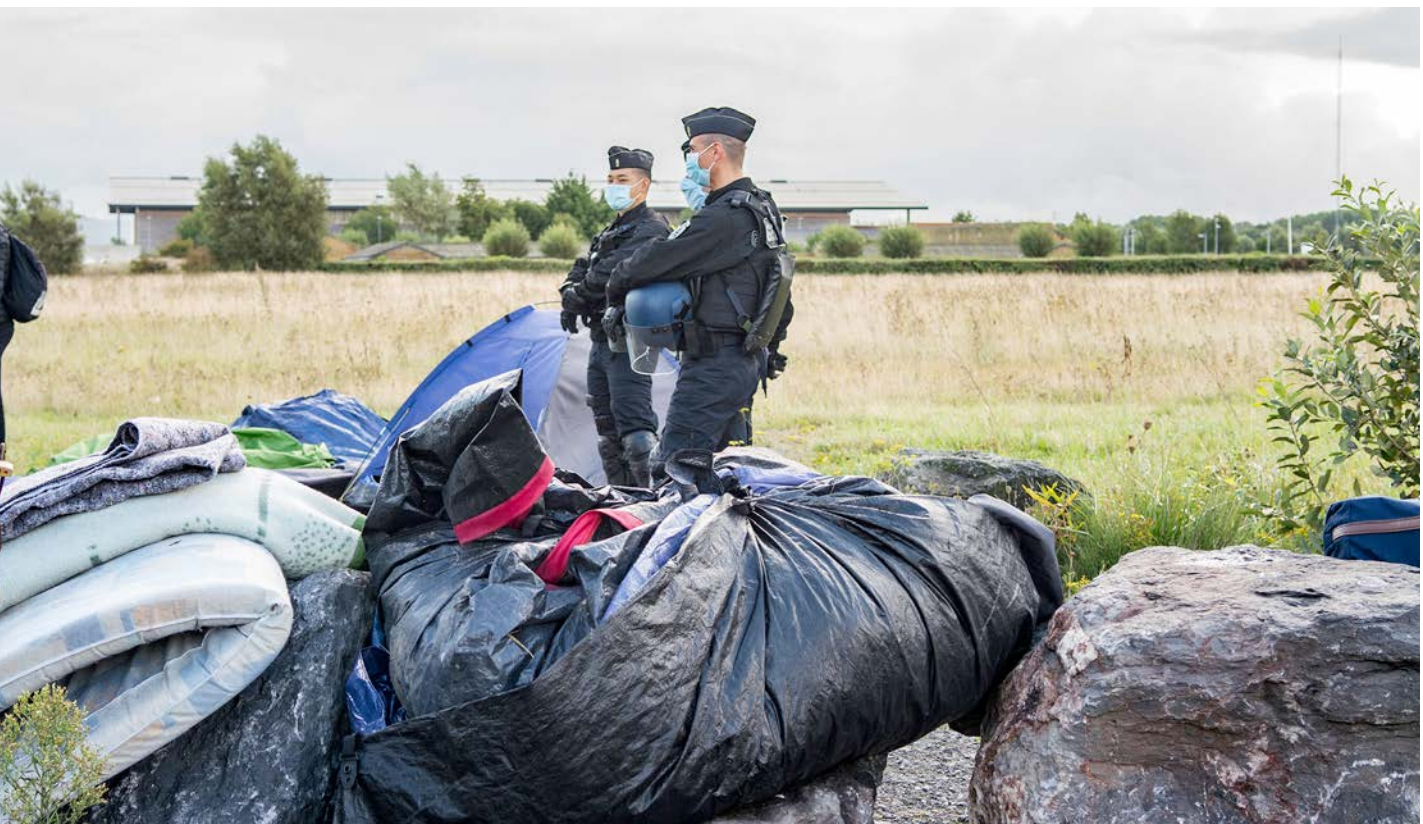
Police overseeing the dismantlement of an informal settlement. The bin bags are filled with mattresses, blankets, tarps and tents.

Instead, people's daily lives have throughout this period been characterised by evictions, police violence and violations of fundamental rights, with insufficient and intermittent access to food, shelter, water, information, and so forth. While these violations continue, the Covid-19 pandemic reinforces this group's acute vulnerability and urgent need of protection. Covid-19 sheltering operations have been insufficient and inadequate across the time period, with many people still requiring safe accommodation. While forced evictions are already in contravention of international human rights law, the continuation of these practices during Covid-19 have subjected displaced people to even greater trauma and distress. The practice also further limits individuals' ability to practise strict social distancing and hygiene practices.