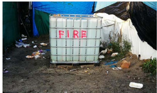
One of the water points installed by volunteers.

Organisations like the Hummingbird Project, Refugee Youth Service and Art Refuge, in partnership with Médecins Sans Frontières, collaborated on making safe spaces, and offered a creative and therapeutic environment for the most vulnerable young people. They, for example, developed a 'Safe Zone', which only children and authorised adults could access.