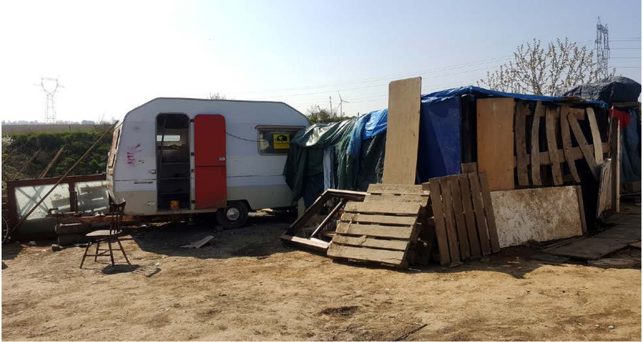
Caravan and shelter in a small camp further away from Calais in 2017.

Indeed, access to water and sanitation services has remained inadequate over the period, as highlighted by the following: