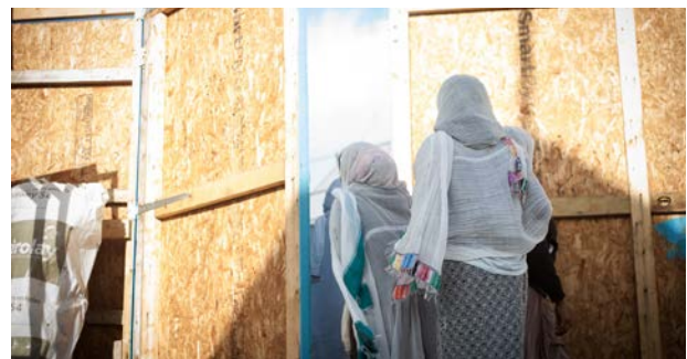
Women entering the orthodox church.

The situation for pregnant women was incredibly precarious. One respondent reported to RRE in February 2016 that she lost her unborn child due to the detrimental effects of tear gas exposure. Another told us that a woman in the camp had "given birth in the back of a truck". These findings suggest that the maternal health of women in the camp was seriously undermined.