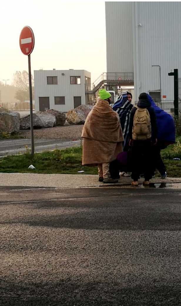
Residents leaving the Calais camp during the eviction.

The authorities announced that access to the camp during the eviction would be limited to those volunteers who are given “access passes”, which was not only a non-transparent process, but also one leading to grievances between different groups.