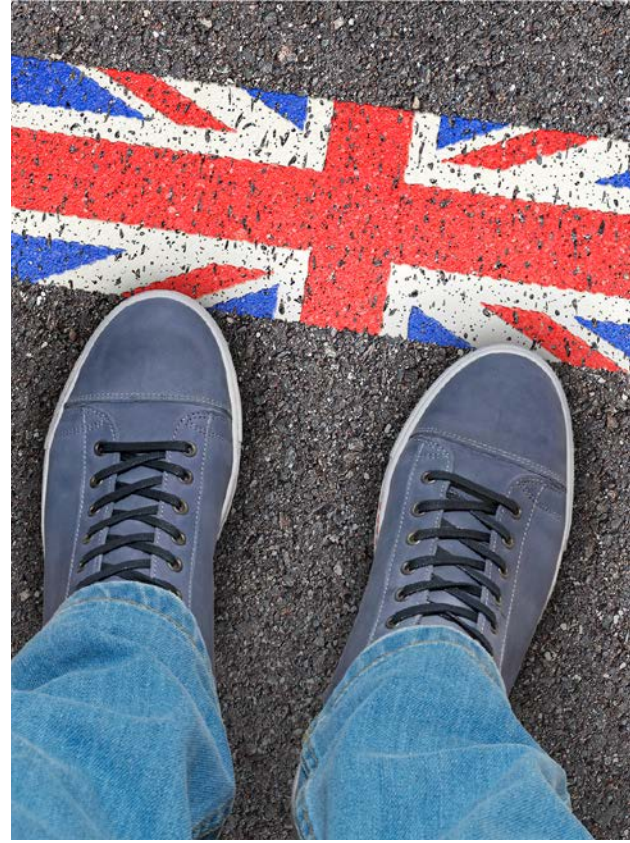
UK flag painted on pavement.

It is important to underline that reception solutions will only work if they are accompanied by a "freeze" on evictions from camps and encampments. For as long as this incessant form of destabilisation and violence continues, displaced people will be prevented from having the time, mental space, support and information necessary