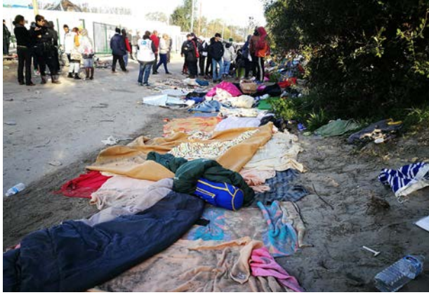
Former camp residents, including children, sleep rough while the camp burns and they wait to be transferred to accommodation centres.