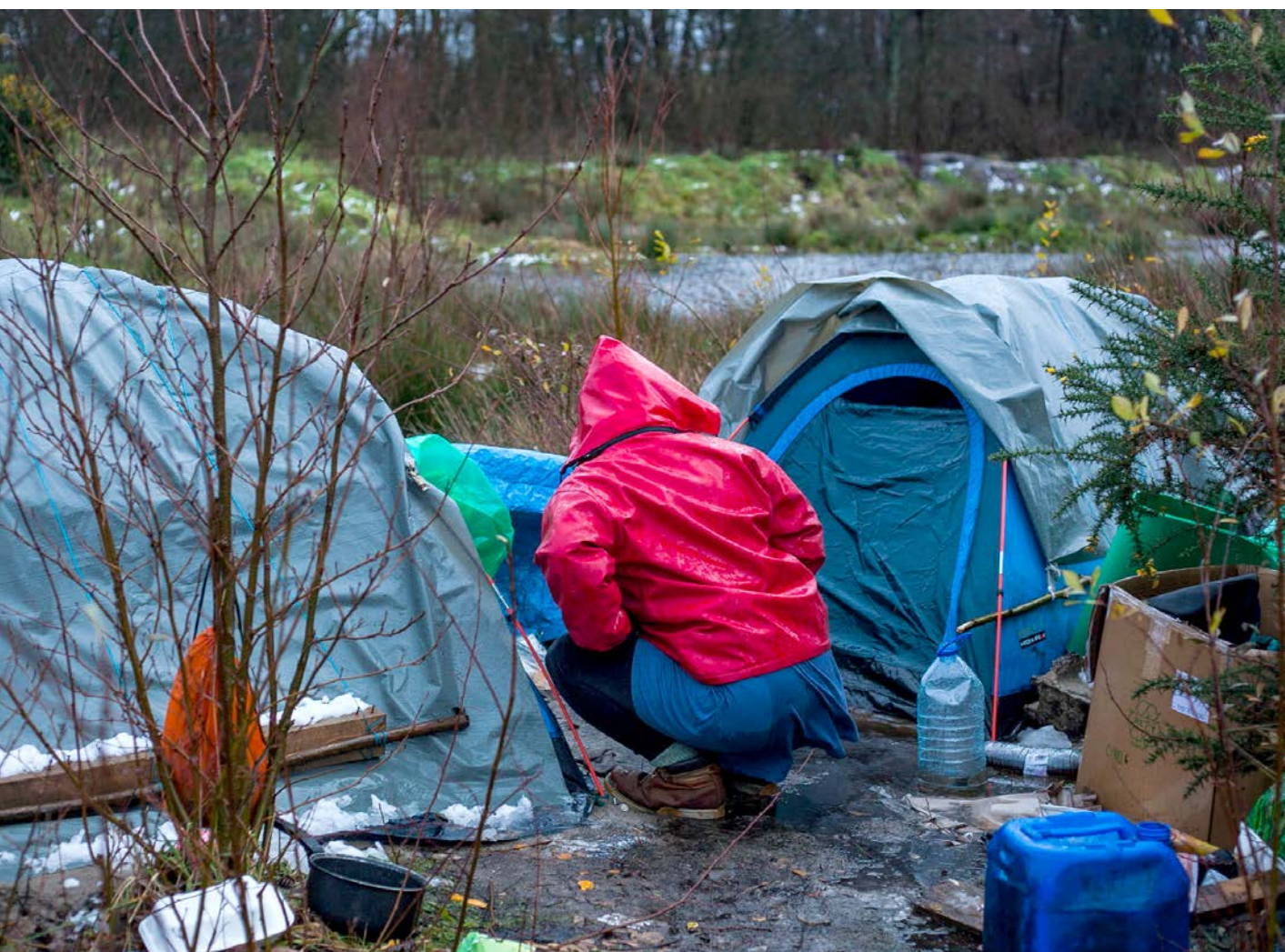
A woman by her tent.

In sum, despite widespread outcries by civil society and rights watchdogs, living conditions have continued to deteriorate consistently. Indeed, persistent acts of uprooting and fencing off potential living spaces continued throughout 2020 and 2021, consisting of the defoliation of living spaces and the use of spikes, barbed wire, fences and walls to prevent people from setting up camp. A key component of this state strategy consists of evictions, as discussed in the next section.