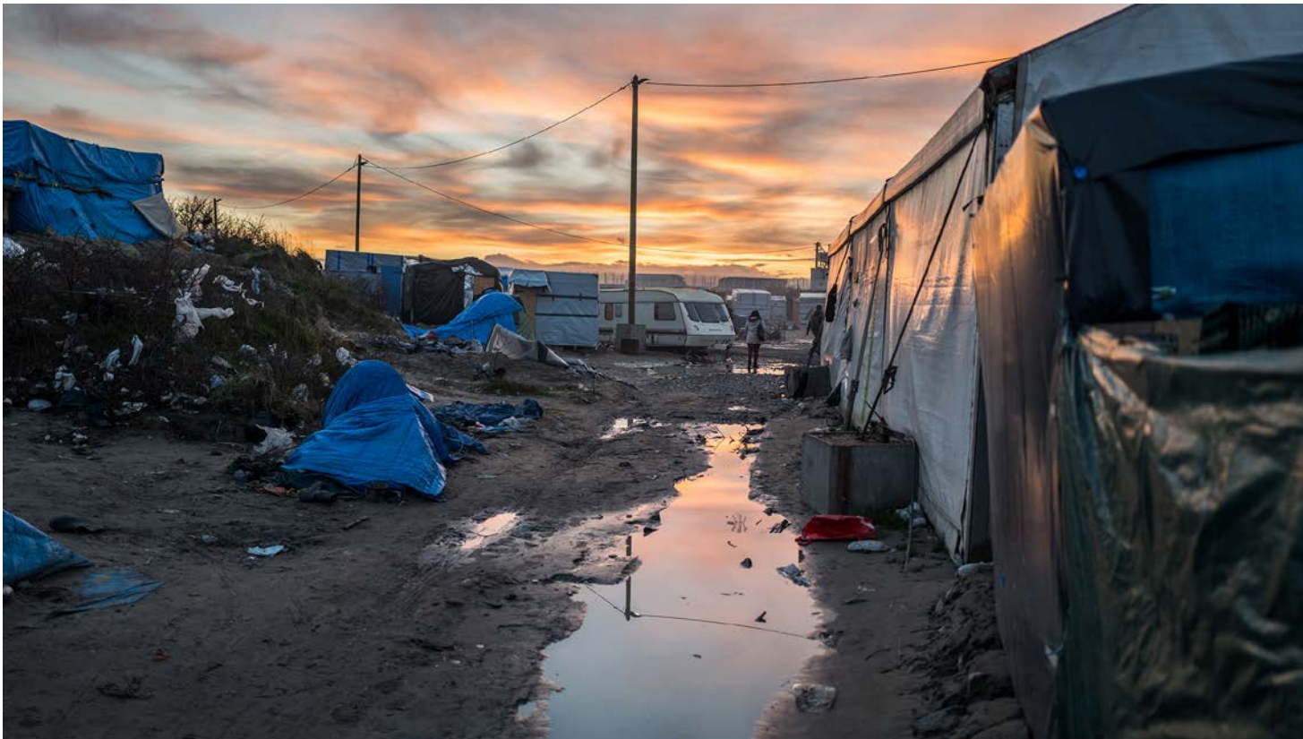
Sunset over the Calais 'Jungle'.

This report is dedicated to all of those who suffered or perished in the northern France area, whilst searching for peace and safety.