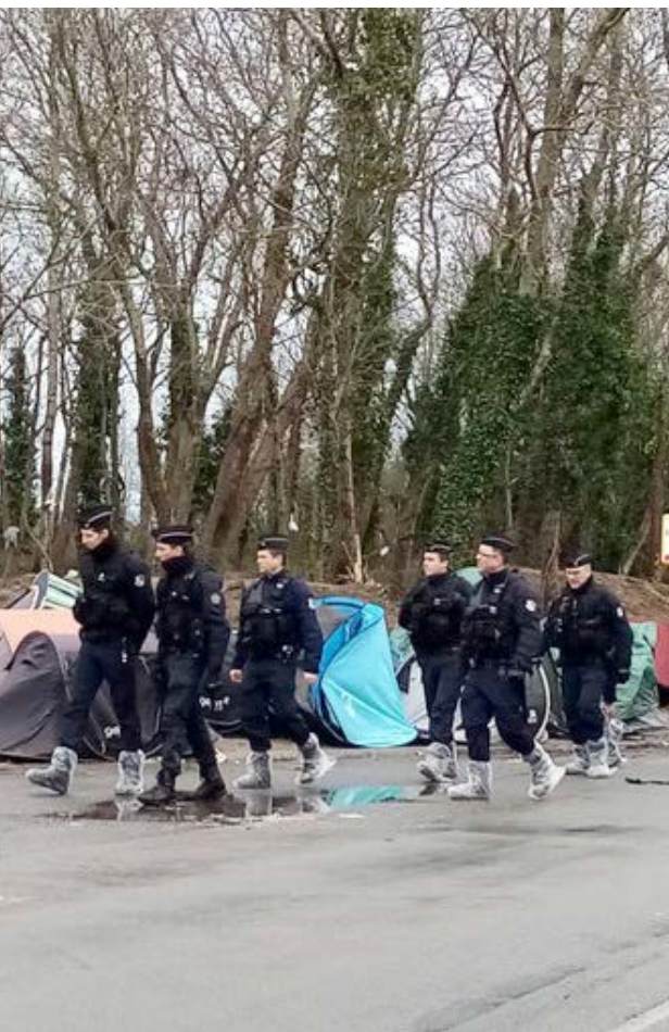
CRS during one of the many evictions.

As mentioned briefly in the previous section, the years following the demolition of the Calais 'Jungle' camp have seen aid and food distribution activities being hampered intermittently, with food distribution areas being regularly fenced off or blocked off with boulders. Meanwhile, volunteers and activists have faced harassment, fines, and overall impediments to their activities. 116