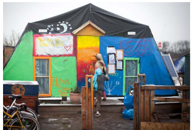
Support tent.