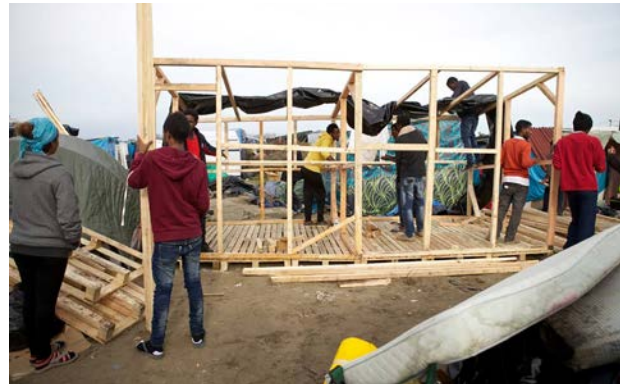
Volunteers and residents building a shelter.

Later on, the containers would become the backdrop to one of the grossest safeguarding failures by the French authorities when, during the final eviction of the camp in October 2016, over 1,500 children were sent to the container camp, where they stayed until taken to the Centres d'Accueil et d'Orientation pour Mineurs Isolés Étrangers (CAOMIEs). Children were left with no running water, disgraceful conditions in the toilet facilities and a complete absence of official safeguarding measures.