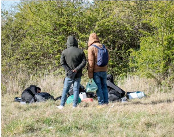
Minors in a field in Northern France.

Following the eviction of the Calais 'Jungle' camp, the situation for unaccompanied minors would start deteriorating further, as safeguarding and protection systems were essentially lacking within the deterrence-based approach adopted by the state – this despite national and international obligations to uphold the rights of the child.