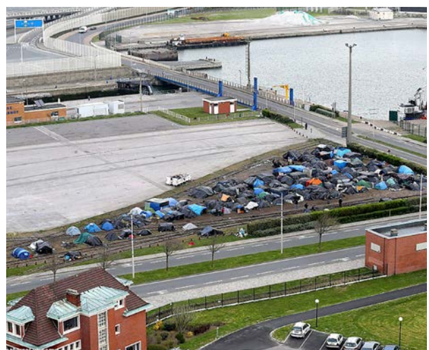
One of the early 'Jungles'.

By July 2009, the group Calais Migrant Solidarity, also known in Calais as the 'No Borders' collective, started documenting and calling out human rights violations. They also started to keep a record of deaths of displaced people. From July 2009 to July 2012, the UNHCR provided legal aid and counselling to individuals in the area; these responsibilities were transferred to the French third-sector organisation France Terre d'Asile in July 2012.