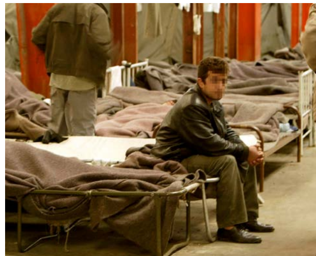
Inside the Sangatte camp.