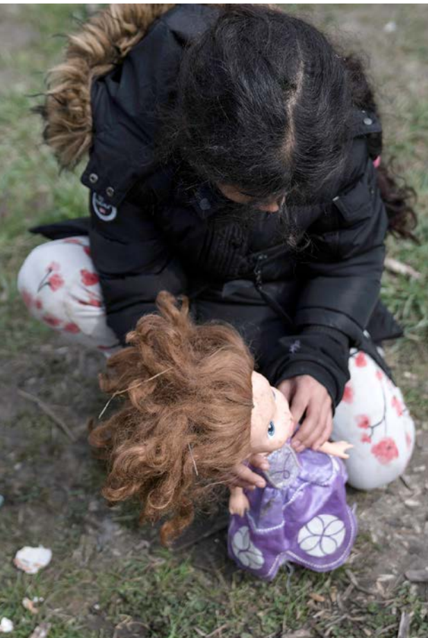
Child playing with her doll.

RYS reiterated a similar warning in April 2018, stating that minors in northern France were sleeping rough in woodlands and continued to face poor sanitation conditions and poor access to health care, legal advice and information. They raised alarm bells regarding exposure to sexual exploitation and abuse, human trafficking and minors being subjected to police violence on a daily basis. According to their estimates, the displaced population in the area had remained stable, with around 600 individuals, including an estimated 100 unaccompanied minors. Interventions from the French state increased, with a frequent clearing of camps, destruction of tents and the use of tear gas – including against sleeping minors. 125