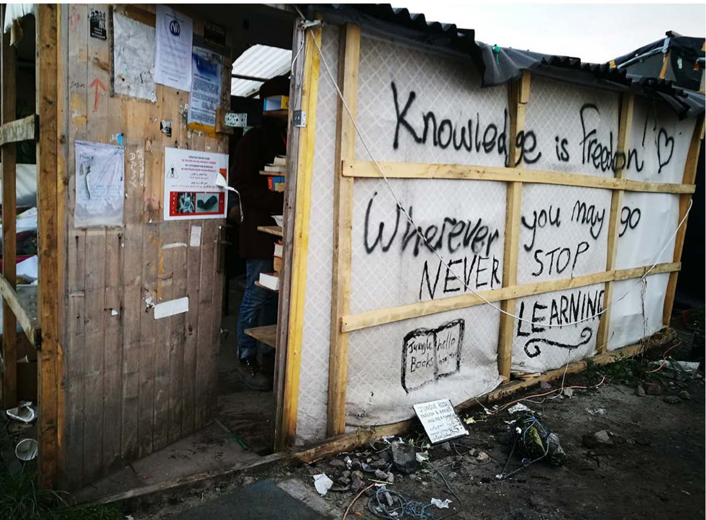
Message on the Jungle Books library shelter.

In carefully reconsidering their ineffective and costly strategy at the border, by seeking constructive avenues for collaboration and by assuming their respective legal and moral responsibilities, the UK and French Governments could put an end to the perpetual violence suffered by displaced people at this border. This would avoid the insalubrious and undignified camp living conditions which have also become a political embarrassment for both States; would more effectively reduce reliance on dangerous irregular migration pathways that by extension fuel the business model of smugglers and traffickers; and better uphold international and European law vis-à-vis the rights of people on the move.