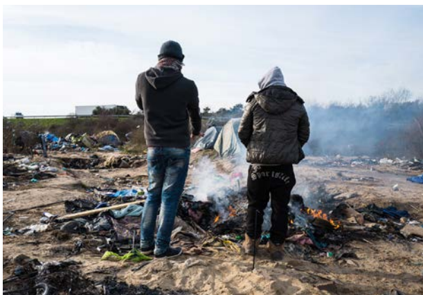
Children warming themselves by a fire amongst fire destruction.

There were attempts to provide “safe spaces” for children, young people and women – although, given the overarching lack of security in the camp and the absence of state support, vulnerable groups were always facing considerable risk whilst in the camp.