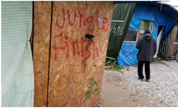
"Jungle Finish"

So, while authorities were celebrating the completion of the demolition, volunteers worked tirelessly amidst the chaos and confusion to provide the basic means of survival through the fence of the now cordoned-off zone, finding accommodation for children in a nearby warehouse and the still-standing Chemin de Dunes school. Volunteers also worked on salvaging any useful goods that could be sent to Greece to assist the crisis for displaced people there.