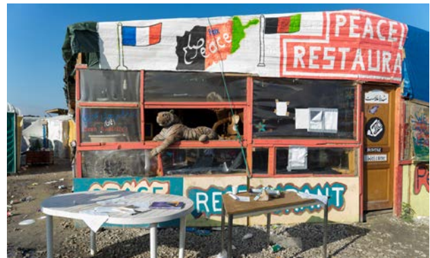
The Peace restaurant.