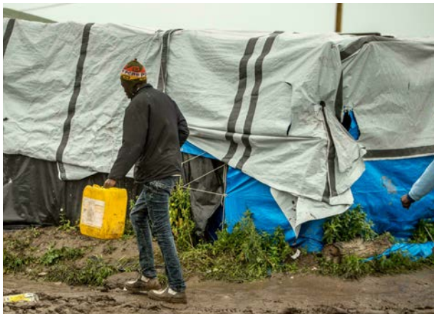
A man walks through the 'New Jungle' migrants camp in Calais.

While the Calais 'Jungle' camp has been romanticised by some, it was to soon receive widespread media attention as the "worst refugee camp in the world." At its peak in 2016, it would come to host up to 10,000 individuals, with large numbers of volunteers and activists arriving from the UK and various countries worldwide to join in solidarity, to offer support and provide services in the absence of state care.