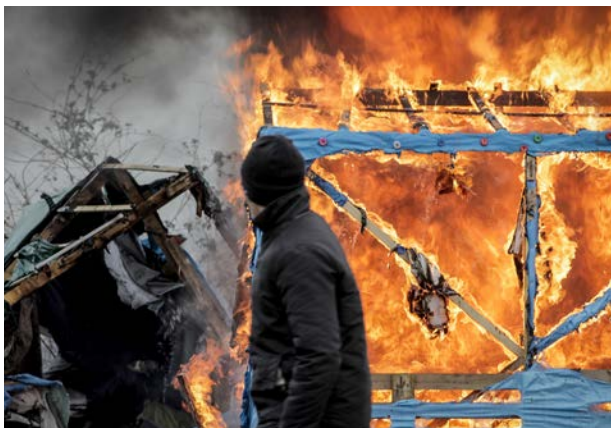
A shelter on fire.

Amidst a burning camp, hundreds of children were sent to the container camp, where they stayed until being taken to the Centres d'Accueil et d'Orientation pour Mineurs Isolés Étrangers (CAOMIEs) one week after everyone else had left. There was no running water for the children, and a complete absence of official safeguarding measures. Refugee Youth Service and other organisations deplored the abhorrent safeguarding gaps during the eviction: "Daily dangers to children ranged from poor sanitation conditions; food insecurity; poor access to health care, legal advice and information along with exposure to sexual exploitation and abuse, human trafficking and being subject to police violence." 77 The specific facilities for accessing the asylum claim procedure (outreach by official organisations, including OFPRA (France's Office for the Protection of Refugees and Stateless Persons), and departures by bus to reception centres) were discontinued.