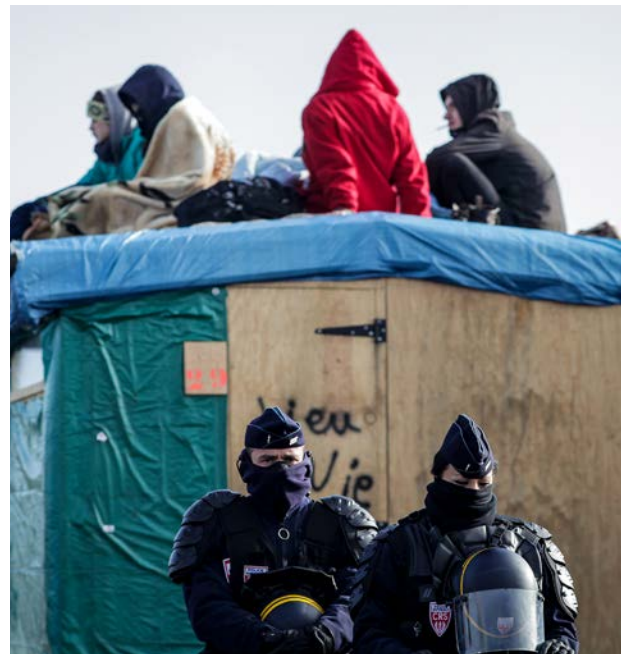
Protesters during the demolition of the camp's South side.

While camp residents and volunteers tried to move as many of the wooden structures and caravans as they could to the other part of the camp, many of the shelters were lost to the demolition. Space in the remaining camp rapidly filled with tents and the scarcity of space led to increased stress, even harsher conditions and potential for conflict, and also further increased the risk of fire.