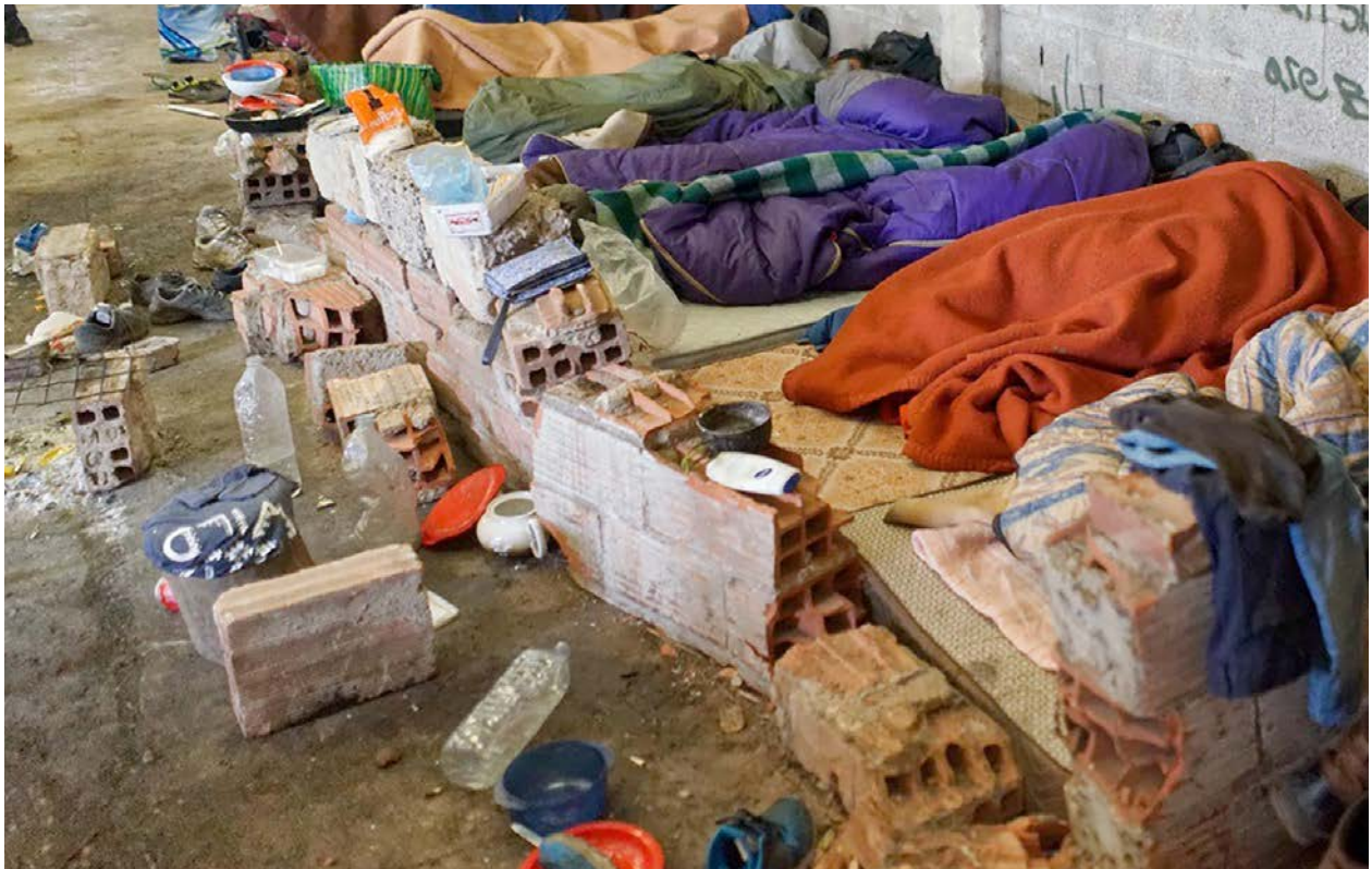
An informal settlement in an abandoned building.

up both police evictions and harassment, 145 as well as harsh measures to intercept and prevent boat crossings. 146 The British Home Secretary has meanwhile continued to place ever harsher restrictions on the right to asylum and to freedom of movement, 147 even though the Home Office's policies have a long track-record of contributing to increasingly dangerous migration journeys across the Channel whilst also inadvertently strengthening the hold of smugglers and traffickers over people attempting to claim asylum and be reunited with friends and family in the UK. 148