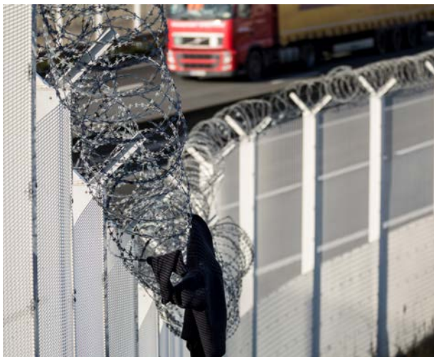
A person trying to climb the tall barbed wire fence along the route to the ferry port lost their sweater.

Settlements created by those blocked at the British border started appearing in the Calais area in the early 1990s, with increased intensity in 1998-1999. 4 As British immigration management policies, such as the imposition of carrier sanctions, 5 made it more difficult to cross the border, the number of displaced people sleeping in the streets of Calais and surrounding areas with the hope of reaching the UK started increasing gradually. In 1999, the French government opened a warehouse in Sangatte run by the Red Cross, one mile from the Eurotunnel entrance. It was used as a camp to shelter migrants in response to the growing number of people present in the area. 6 The Sangatte camp was intended to be able to accommodate up to 600 people at any given time.