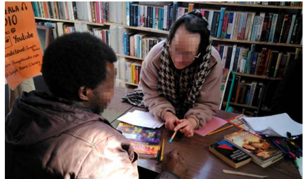
Inside Jungle Books.

A number of fixed compounds like Belgian Kitchen, Ashram Kitchen and Kitchen in Calais were set up in the camp, providing reliable food at multiple times during the day. Furthermore, Refugee Community Kitchen (RCK) coordinated pop-up distributions of hot food daily. While RCK initially started with a centralised distribution point, they later coordinated a de-centralised distribution system in different parts of the camp, adapting to a growing population and avoiding the creation of overly