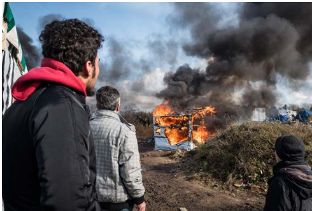
Residents observing a shelter in flames.

In July 2016, the Bar Human Rights Committee undertook a mission to northern France to investigate repeated allegations of excessive force used by the French police in camps, and the alleged failure by the French police to protect the camps and its residents from violence and threats by organised groups outside the camps. They also aimed to gather information on the issue of access to legal services and adequate information for people in the camps. Its subsequent report 72 highlighted four primary human rights concerns in relation to policing: