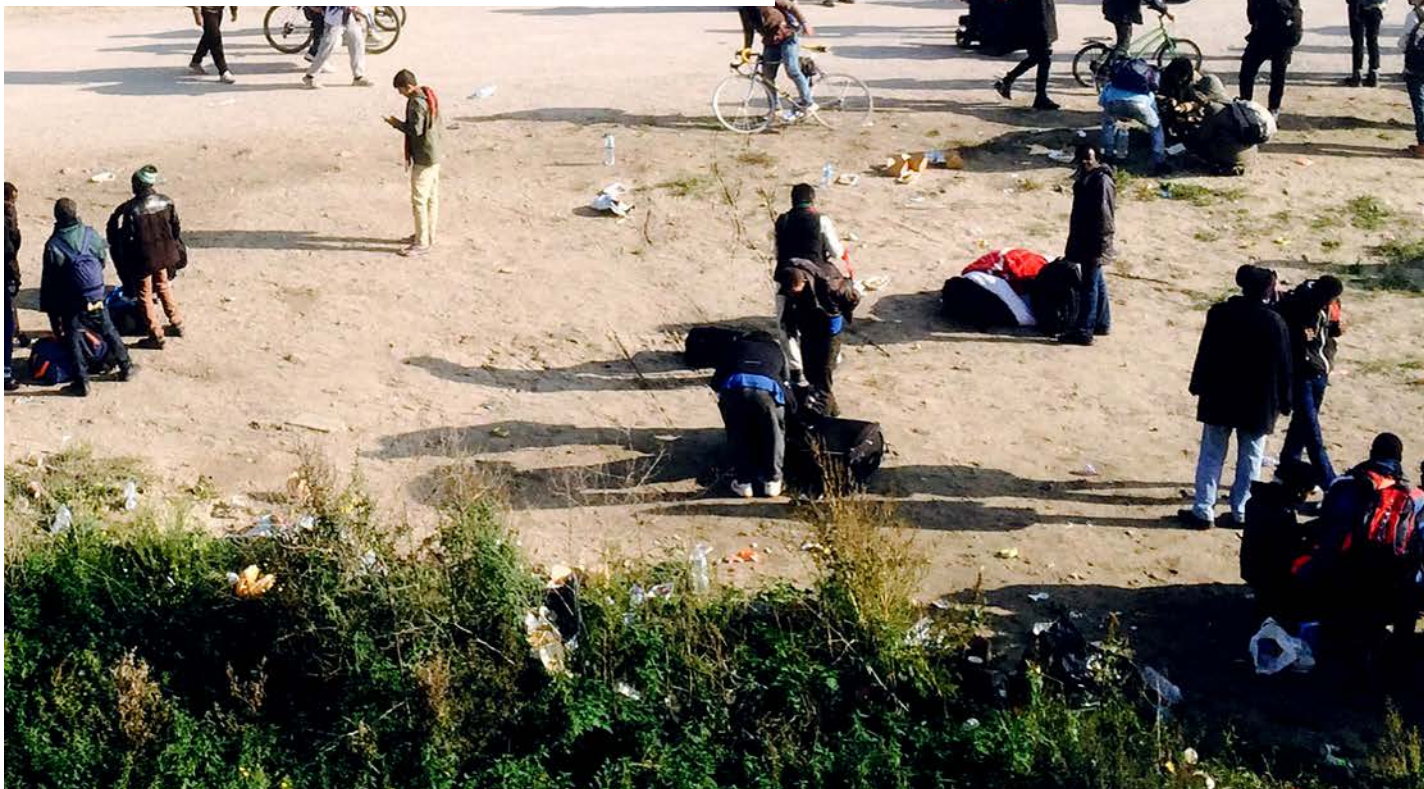
People leaving the Calais camp while fires have started.