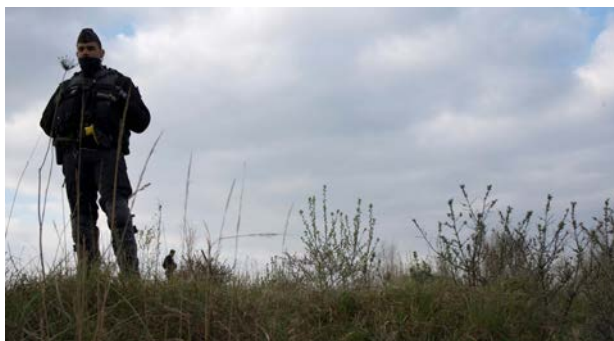
A police officer in northern France.

In three separate research reports published by Project Play in 2020 and 2021, 131 the group highlighted a number of grave and persistent violations of children's rights occurring on a daily basis. Project Play, moreover, documented the wholly inadequate state response to protect vulnerable children, including: