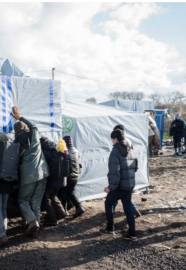
Residents and volunteers move a shelter to save it from demolition.

At this time, bulldozers moved in to clear a 100-meter-wide strip (a "buffer zone") next to the motorway that ran past the camp, intended as an alleged security measure to prevent individuals' access to lorries travelling along the road, to enable the police greater control over camp residents. Volunteers and camp residents managed to move most shelters away from the buffer zone prior to demolition. 40