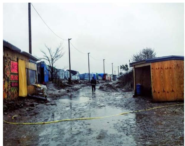
The camp’s “high street”.