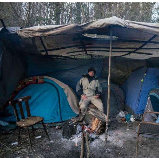
A man sitting by a fire in an improvised shelter.

In theory, as part of the specific purpose of this operation in providing accommodation for people, a social diagnosis should be carried out beforehand in order to assess individual needs and differing levels of vulnerability, as prescribed by the law. 107 For example, an unaccompanied child should be offered a different type of accommodation to that proposed to an adult man. However, in practice, such a census or preliminary social diagnosis is rarely carried out, resulting in a situation whereby unaccompanied children and other at-risk groups are not offered appropriate accommodation, which can worsen their already vulnerable situation. During certain forced sheltering operations, unaccompanied children are sometimes placed on the same buses as adults and can sometimes be sent to adult reception centres. Once again, rather than safeguarding and protecting vulnerable groups, the authorities that carry out these forced sheltering operations often violate basic fundamental human rights as part of the generalised state strategy of deterrence.