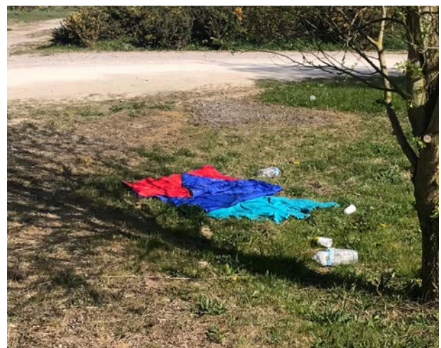
An abandoned sleeping spot.