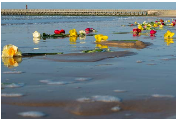
Flowers in the sea off the Calais coast, in memory of those who died at the border.

to envisage entering French asylum procedures, pursuing their onward journey to seek protection in the UK, or other options open to them. Instead, people are left in a perpetual state of stress and trauma, increasing the likelihood of falling victim to misinformation, trafficking and other forms of exploitation.