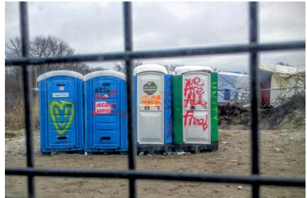
Toilets in the “Jungle”.

arriving in the Calais camp. For the largest proportion, 40.4%, the problem originated due to being subjected to the camp’s ‘unhealthy environment’ – often due to the cold weather, lack of a decent mattress to sleep on, or poor living conditions in general. A further 8.4% said that the issues were caused by ‘a contagious disease spread inside the camp’.