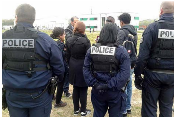
Six police officers surround the RRE research team in 2017 and demand passport details and information about the study.