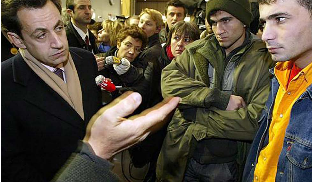
Sarkozy speaking to two displaced people.

By October 2002, the UN Refugee Agency (UNHCR) had established a permanent presence in the Sangatte camp, providing legal counselling and advice. A population of over 3,000 people was estimated to be present in the area by this time, with an average of 1,700 present in the camp, thus clearly exceeding the maximum intended capacity. The UNHCR and the Red Cross reported that more than 80% of individuals in the area came from Iraq, Afghanistan, and Sudan. 7 At the end of 2002, due to significant pressure from the UK government, which described the Sangatte centre as a 'pull factor' attracting more people to the area, 8 Nicolas Sarkozy, then French minister for Home Affairs, announced the camp's closure. This came after two unsuccessful legal proceedings initiated by the private operator Eurotunnel to have the centre closed. A so-called 'burden sharing agreement' followed, in which the UK agreed to take responsibility for approximately 1,000 Iraqi Kurds and 200 Afghans as part of work visa arrangements, while France took responsibility for the remaining 300 individuals in the Sangatte centre. 9