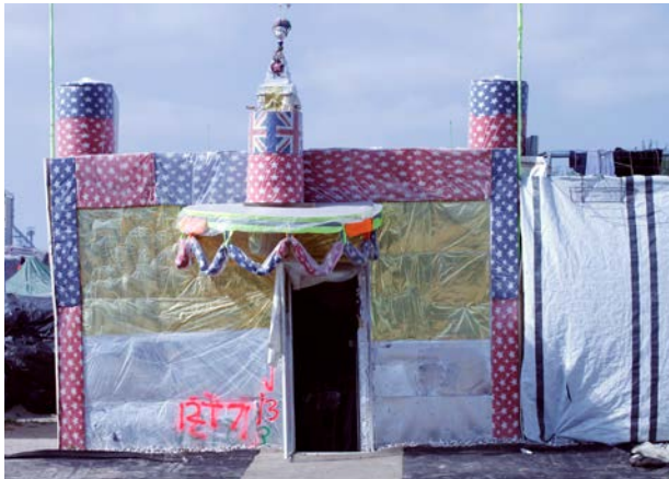
One impressive example of the creativity and ingenuity of shelter making in the Calais 'Jungle'.