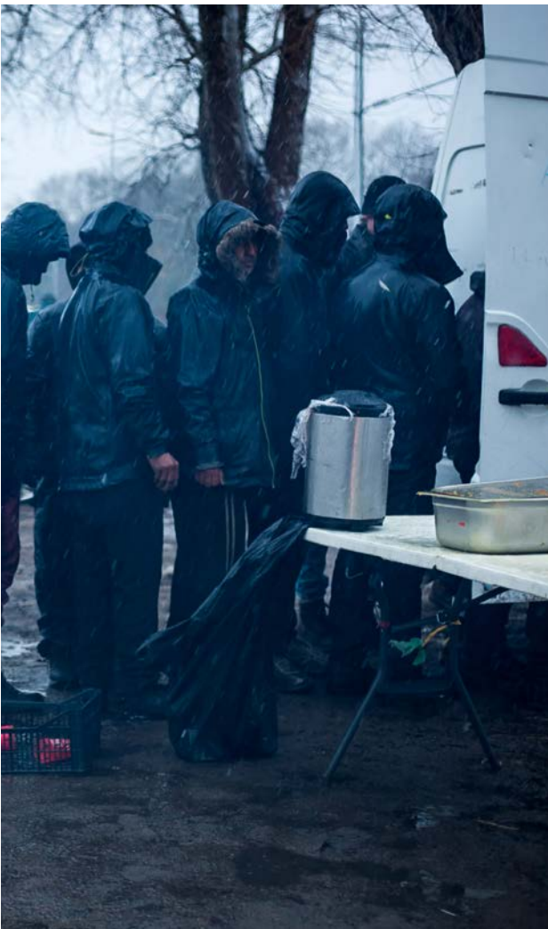
A mobile distribution during winter.

In Spring 2018 the French state contracted La Vie Active to provide food in Calais. While organisations like Refugee Community Kitchen and Utopia 56 honoured this new approach by temporarily pausing their daytime hot food distributions, some displaced people refused the government-funded food. An informal survey conducted by volunteers based at the l'Auberge des Migrants and Help Refugees warehouse found that 68% of respondents refused the food because it came from the same authorities that legitimise violence against them. 42% said they were frightened by excessive police presence at the distribution sites. 85