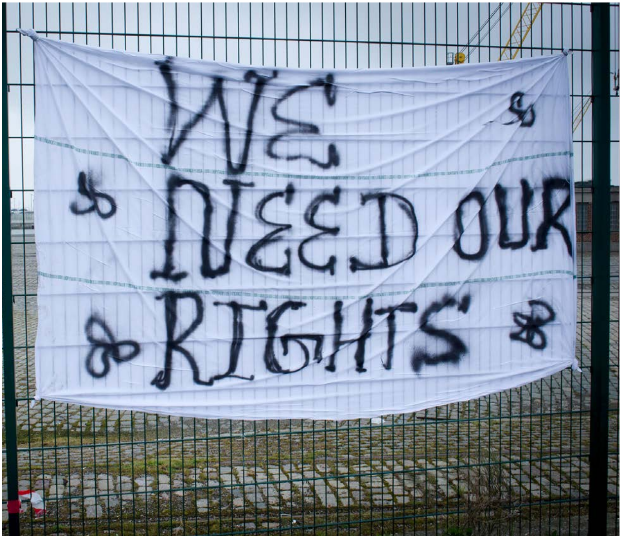
Banner hung up next to one of the early 'Jungles'.

It is clear that no building of walls and erection of fences is going to stop displaced people from trying to find a safe and viable future, and the sooner a just response to human mobility is found, the sooner we will see an end to the violence, suffering and exhaustion witnessed in the northern France area, five years on from the Calais 'Jungle' camp.