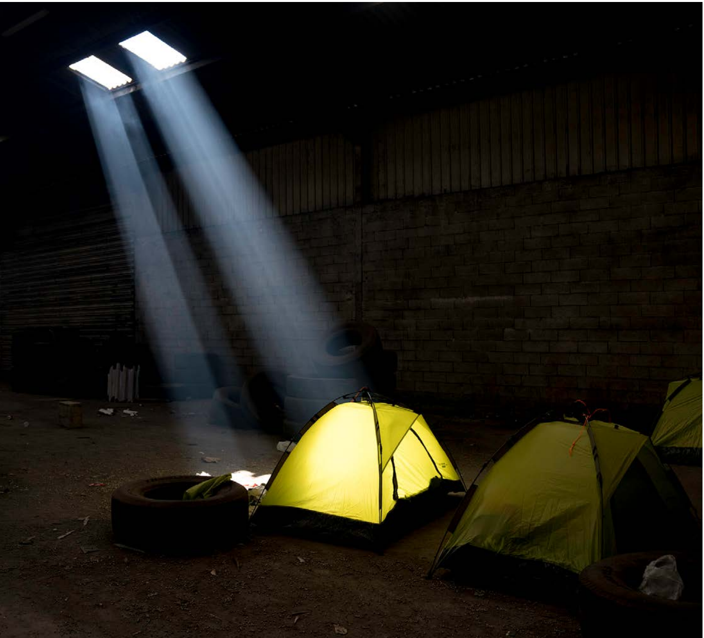
Tent in an abandoned building in the Calais area.

On that note, we invite you to explore this report and delve into the complex situation before, during and after the time of the Calais 'jungle' camp.