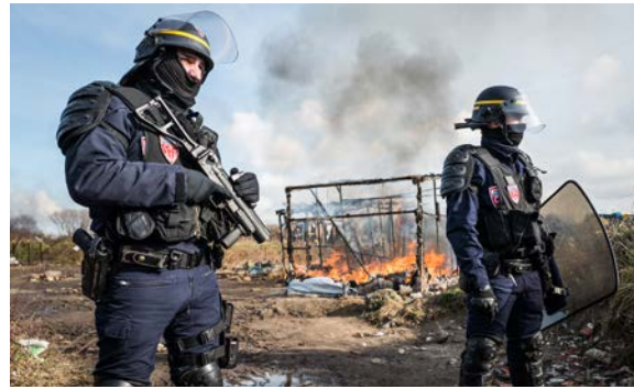
Heavily geared CRS officers during the eviction of the South part of the camp.

The manner and systematic use of tear gas in Calais at the time of the Jungle gave cause for serious concern. RRE's aforementioned study found that 20.5% of respondents had experienced tear gas on a daily basis during their time in the camp, while 42.3% had been exposed multiple times a week. It was often reported that tear gas was not used to disperse a crowd but was targeted towards individuals to ensure maximum impact and damage to that person. For example, one respondent told RRE that two residents were arrested and held in a police van after being found attempting to travel to the UK. Police personnel detonated a tear gas canister in the back of the van, and locked the doors for more than 20 minutes.