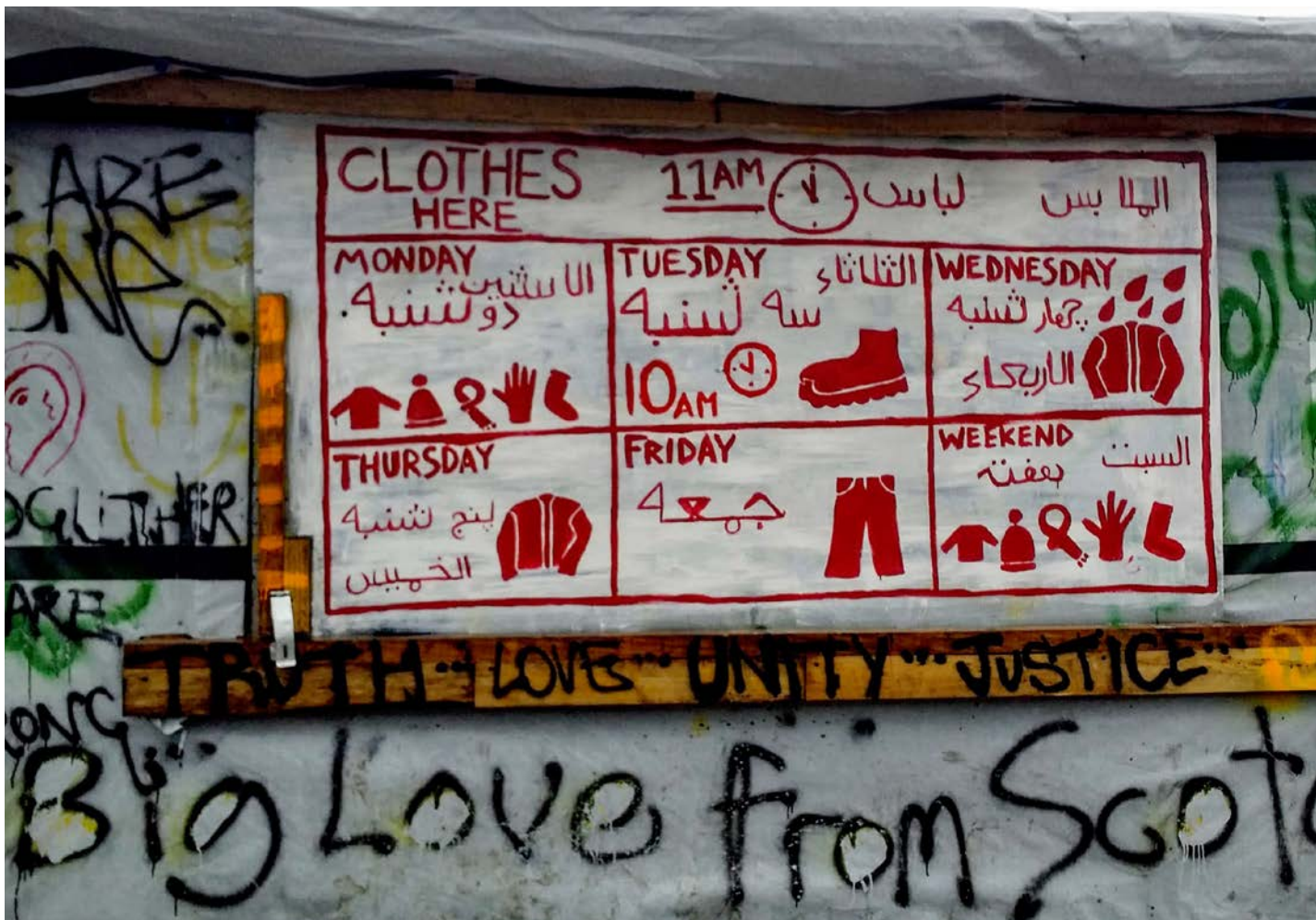
Distribution sign indicating the times for distribution of different items.

The Calaidipedia was an essential online resource for those already on site and those planning to travel to Calais to get involved, offering updates and information on donation and volunteer needs for different groups. 20 It has since been archived, but remains an impressive collection documenting the history of the camp and the initiatives and processes within it.