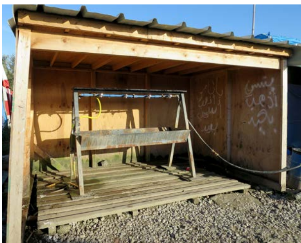
One of the water points in the camp.

At the time of the research, there were a number of different medical facilities in the camp provided by various charitable organisations and NGOs, including Médecins Sans Frontières and Doctors of the World. Respondents generally spoke highly of these organisations and their staff, explaining that they were working very hard to help. Therefore, the largest proportion, 40% of respondents, described the medical care they received as ‘OK’, while 20.5% noted that the care was ‘very good’ or ‘excellent’. However, a number of those surveyed identified a lack of medical supplies to be a problem. Since the medical organisations operating in the camp were relatively limited in their ability to distribute prescription drugs, many of the camp’s inhabitants said they were given paracetamol – often insufficient to treat their various and complex health issues.