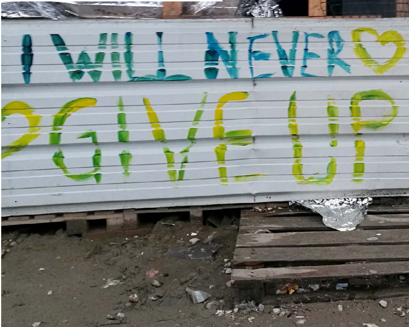
"I will never give up." Note on the remains of one of the restaurants in the Calais camp.