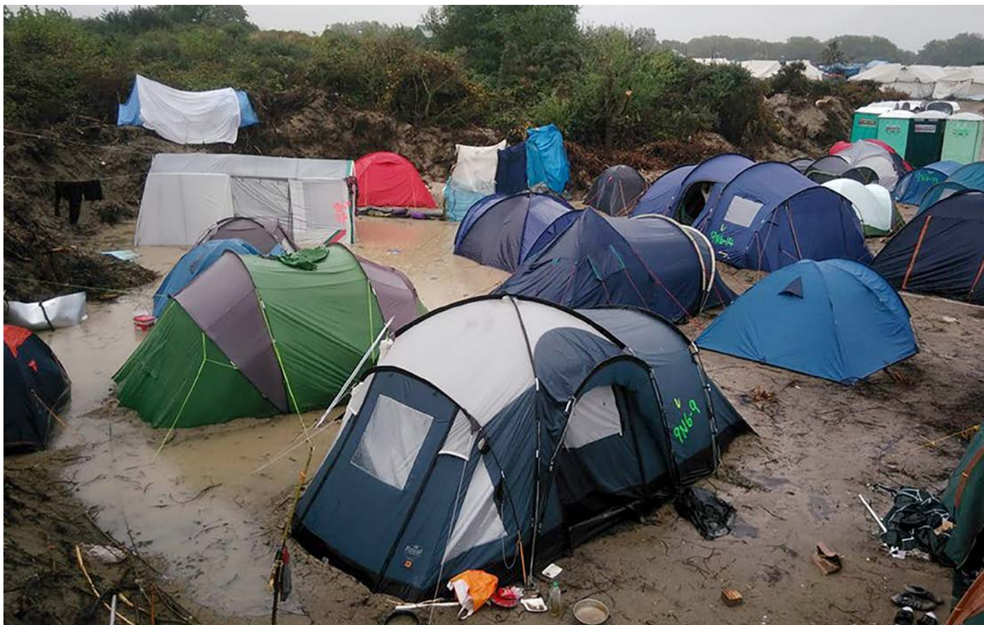
After heavy rainfall - a flooded area of the camp.

Despite such outcries, the human rights violations and wholly inadequate living conditions and accompanying lack of safety continued throughout the time of the Calais 'Jungle' camp, as outlined in greater detail below.