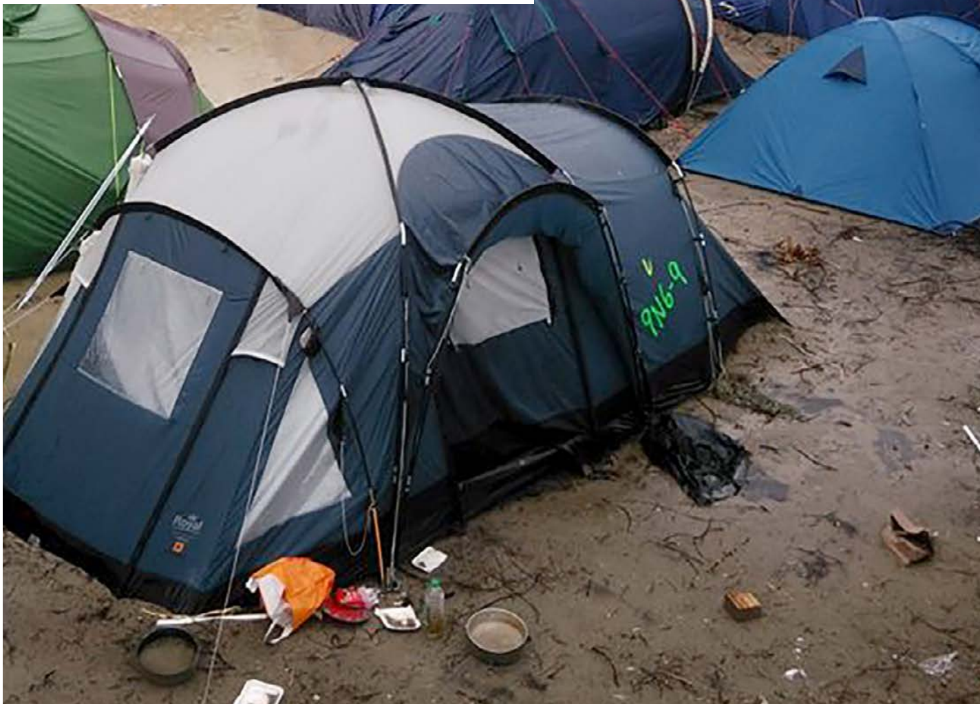
Tents in mud.