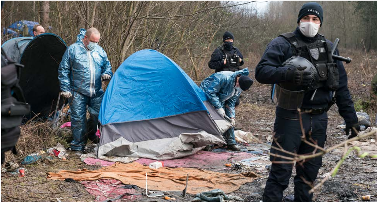
Police guarding the dismantlement of an informal settlement in the woods.

In its attempt to prevent 'fixation points' in the area, the authorities have been denying people access to adequate shelter and hampering aid work through an intimidating presence at distribution points and in community spaces. Importantly, soon after the demolition of the Jungle camp, the state authorities would also set in motion a ceaseless cycle of evictions and the dismantling of informal living spaces.