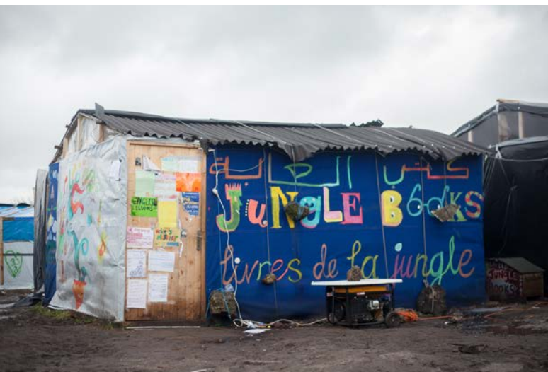
Jungle Books building.

Miracle Street set up a bike-based phone charging station.