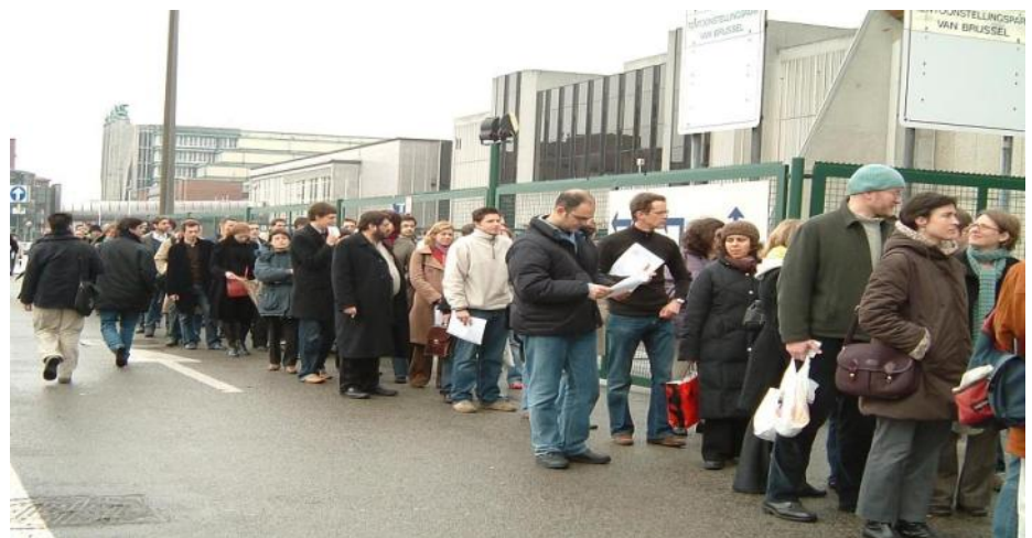
Unemployment line: Unemployed citizens in Europe lining up for unemployment benefits. Most developing countries cannot afford such benefits—it is a better strategy to ensure full employment.

(This paper was written by Martin Khor, Executive Director of the South Centre.)