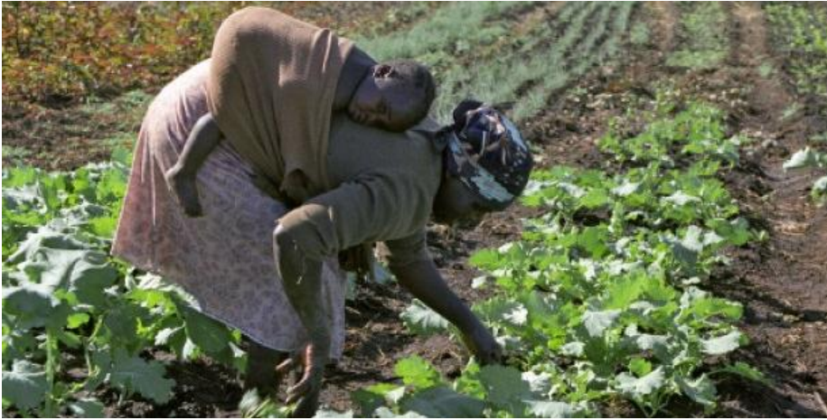
Rural livelihoods that provide enough income is a major component of "Full Employment".

nised full and productive employment as a major need to be promoted and created at all levels.