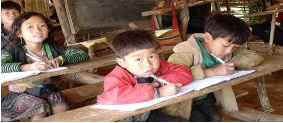
Sustainable development, a rich and complex concept, should be operationalized to give a safe and sound future for our children.

ment and serve as a driver for implementation and mainstreaming of sustainable development in the United Nations system as a whole.