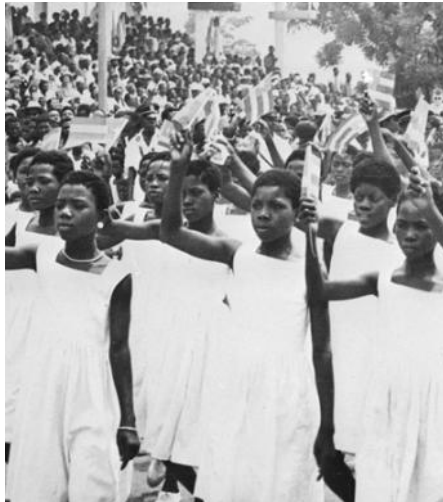
Children take part in Independence Day celebration in Togo in 1960: The struggle for de-colonization continues in many developing countries.

The availability and cost of medicine, the overwhelming proportion of which is still sourced from developed countries, has been a sore point for developing countries for a long time. Moreover, too much (as compared to the afflicted population) research and medical production are oriented toward diseases and maladies in the developed countries. Should there be agreed global goals in terms for the "right" kinds of medicines and their affordability? Which parties should accept these goals as their obligation?