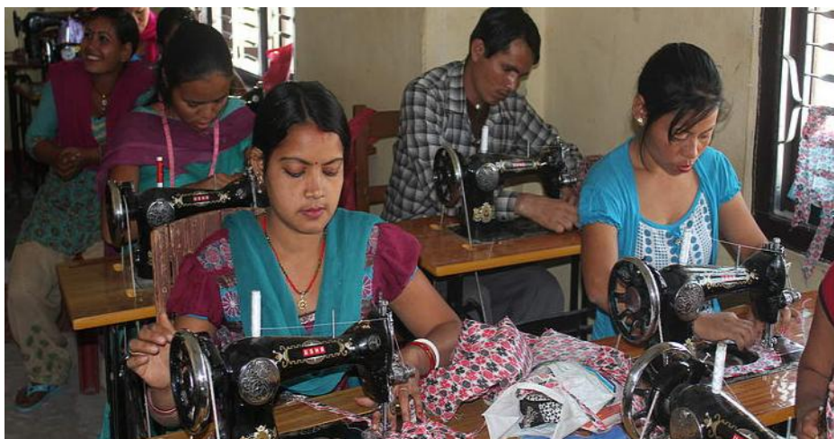
Full employment should be a top-priority goal of the set of SDGs and for the Post-2015 Development Agenda.

This paper first stresses the global dimension (what developed countries and international organisations can do for developing countries) in each goal, then addresses national level efforts, and concludes with means of implementation (finance and technology).