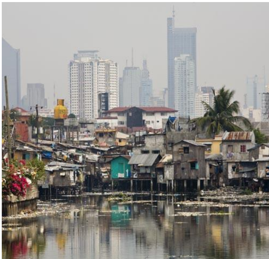
Slum houses in an unhealthy environment co-existing with modern high-rise buildings is a stark contrast that depicts poverty and inequality -- two issues that should have priority in the Development Agenda.

Without this, progress in human and social development would naturally depend on external and domestic transfer mechanisms - that is, aid and redistribution of public spending, respectively. Since there are limits to such transfers, social progress cannot go very far without an adequate pace