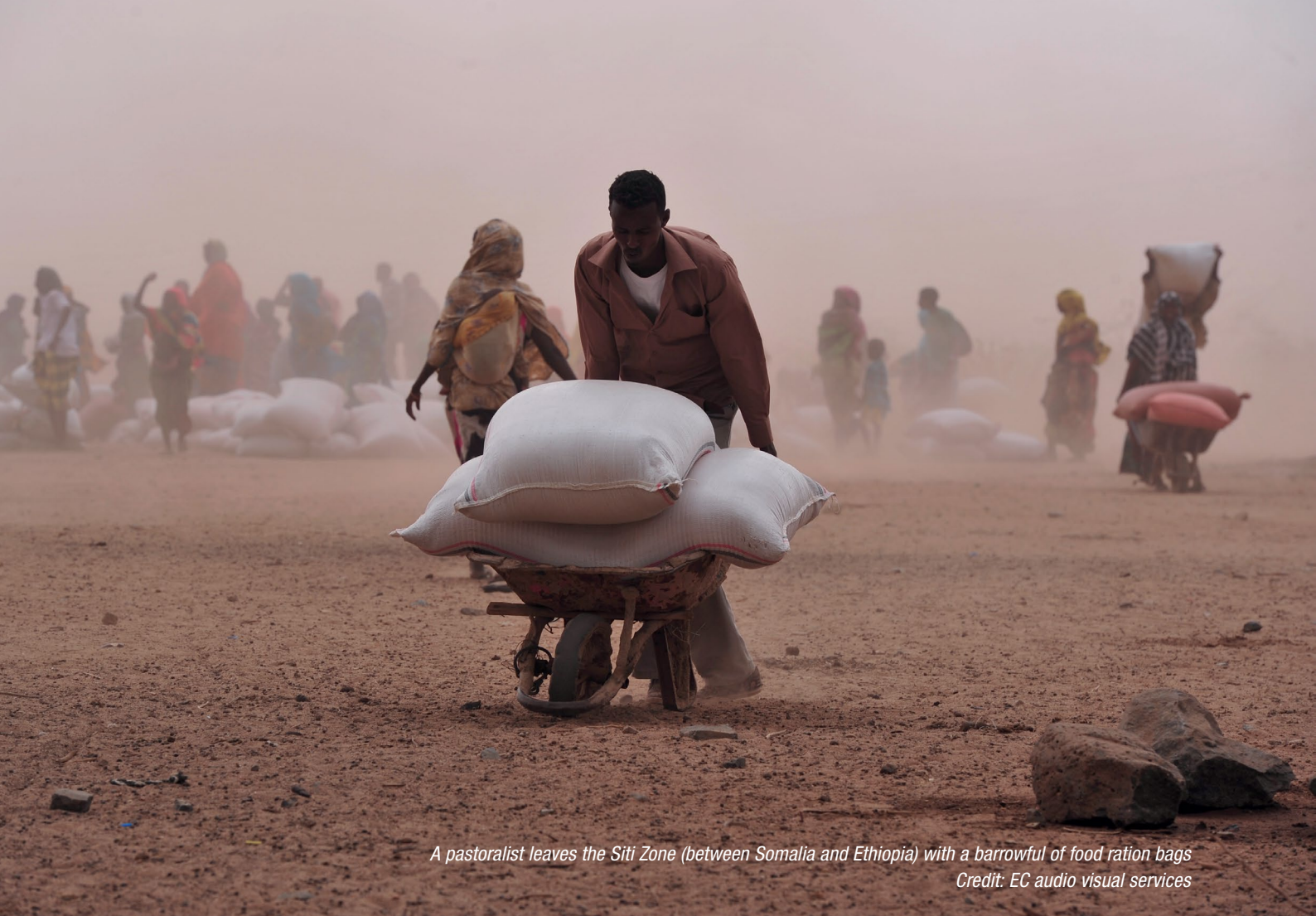
A pastoralist leaves the Siti Zone (between Somalia and Ethiopia) with a barrowful of food ration bags

alternative to migration establishing a link between migration and local development. With a budget of €47 million Resilience Building in Ethiopia (RESET II) aims at improving food security, access to basic services and enhanced livelihoods in conflict-prone areas in Ethiopia. The action is built on the pre-existing RESET programme (2012-2016), jointly funded by DEVCO and ECHO. As such, it is in line with the objectives of the 11th EDF 151 . The project Regional Development and Protection Programme in Ethiopia (RDPP), worth €30 million, aims at improving the living conditions and addressing the long-term development and protection needs of refugees and their host communities. It is a classic refugee response program. With €25 million from the EUTF, the action Facility on Sustainable and Dignified Return and Reintegration in support of the Khartoum Process (FSDRRK) supports the development and implementation of sustainable return and reintegration policies and processes to facilitate the return and reintegration of migrants in targeted partner countries of origin, transit and destination. The last project implemented in Ethiopia, Building Resilience to Impacts of El Niño through Integrated Complementary Actions to the EU Resilience Building Programme in Ethiopia (RESET Plus), aims to address, with a budget of €22.5 million, the structural and systemic root causes of vulnerability and chronic food and nutrition insecurity in the most vulnerable areas.