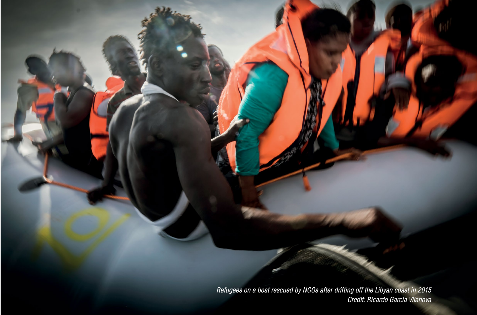
Refugees on a boat rescued by NGOs after drifting off the Libyan coast in 2015

to enhance their capacities to address migration flows, rescue migrants, promote human rights and fight against the smuggling networks. The action could entail the set-up of two inter-agency control facilities in Tripoli.