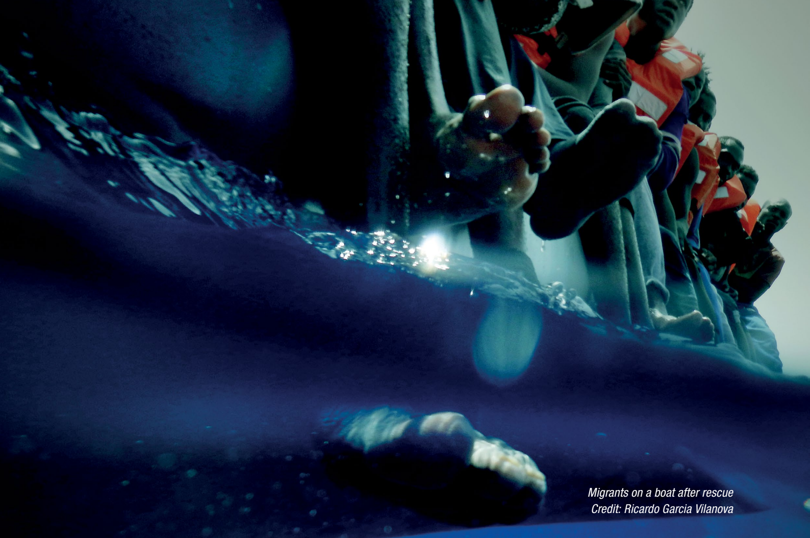
Migrants on a boat after rescue

aspects through a high level political dialogue with Al-Sarraj government. This complex situation calls for EU institutions as well as CSOs to deepen the reflection on principles, criteria and flexible programming, understanding better the contiguity and interaction between development, humanitarian and security actions, and the linkages between relief, rehabilitation and development (LRRD), with peace building, while ensuring to do no harm. In this sense the strategic orientation of EUTF should be better formulated. The current document 68 is insufficient in addressing very complicated conditions such as those existing in Libya.