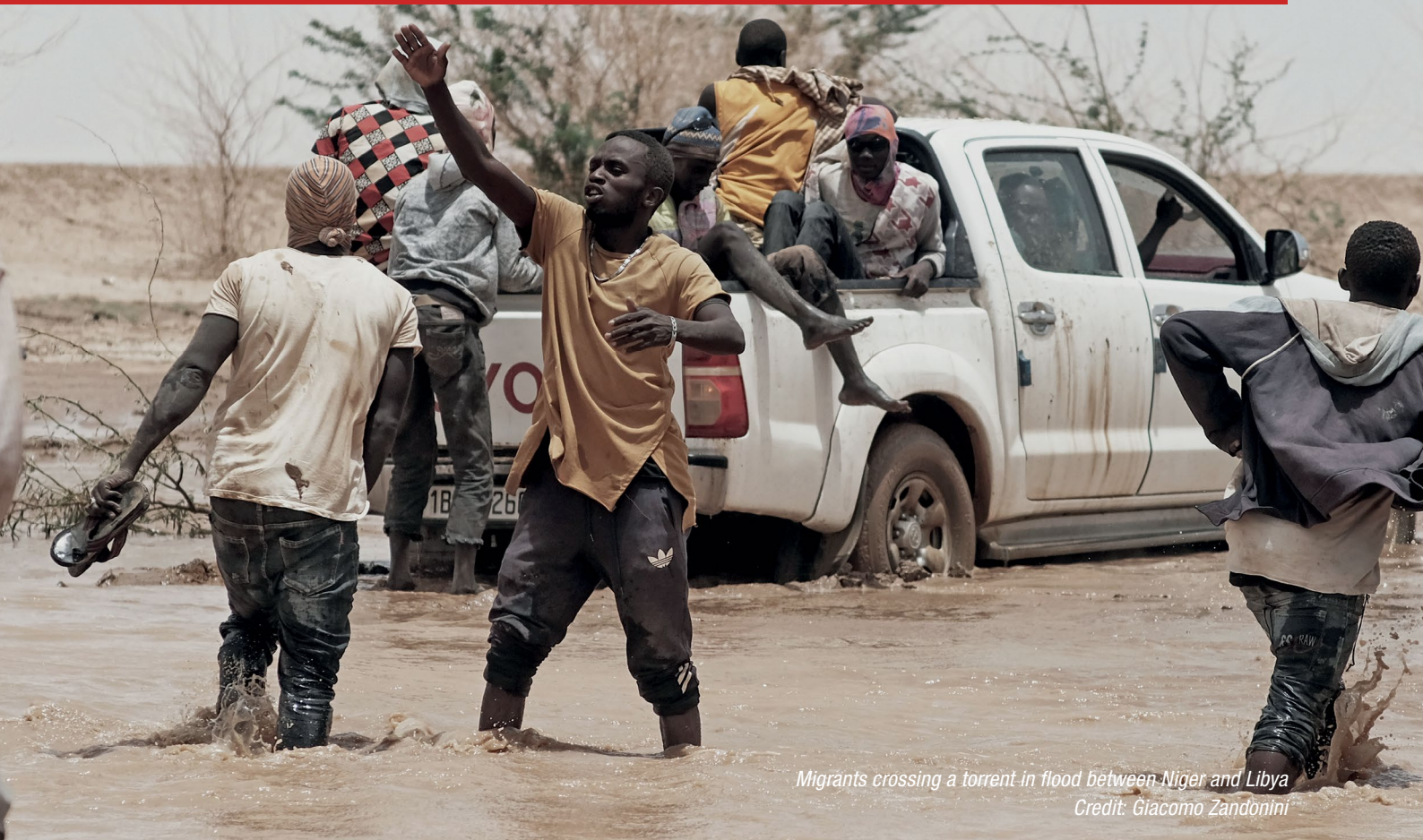
Migrants crossing a torrent in flood between Niger and Libya

The establishment of the EUTF took place in the context of a global debate over the role and nature of the EU's development aid. Recent major EU policies, the 2016 New Partnership Framework on Migration , the 2016 Global Strategy for the EU's Foreign and Security Policy , and the 2017 European Consensus on development , have indeed called for more flexible European development policies, better aligned with EU's strategic priorities, that can be used as a leverage for cooperation on a broader political agenda. The EUTF seems to fulfil these expectations by allowing projects funded with ODA to benefit from simplified, faster procedures than standard EDF projects, to reflect political concerns in the Member States and to be used as leverage for increased cooperation in the field of migration. As a Member State official confirms: "the novelty with the EUTF is that it allows to decompartmentalise European instruments in order to fund, with development funding, both development, and stabilisation, governance and security actions" 157 .