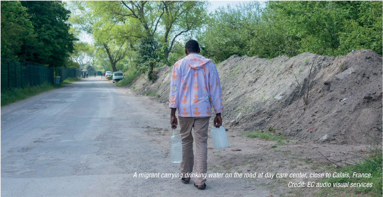
A migrant carrying drinking water on the road at day care center, close to Calais, France.