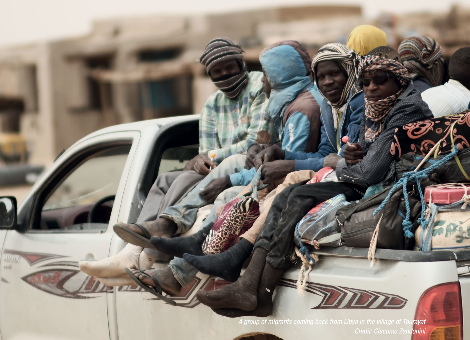
A group of migrants coming back from Libya in the village of Tourayat

Accordingly, CONCORD suggests several recommendations that concern specifically the three key countries analysed but that have also general validity for the EUTF and Migration Compacts, notably: