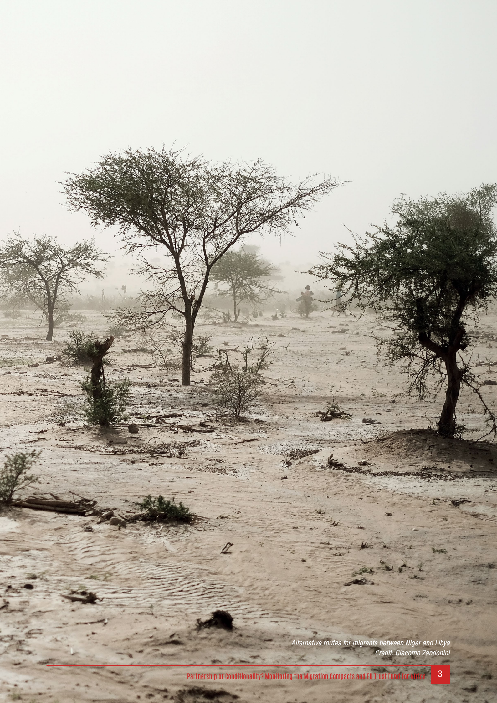
Alternative routes for migrants between Niger and Libya