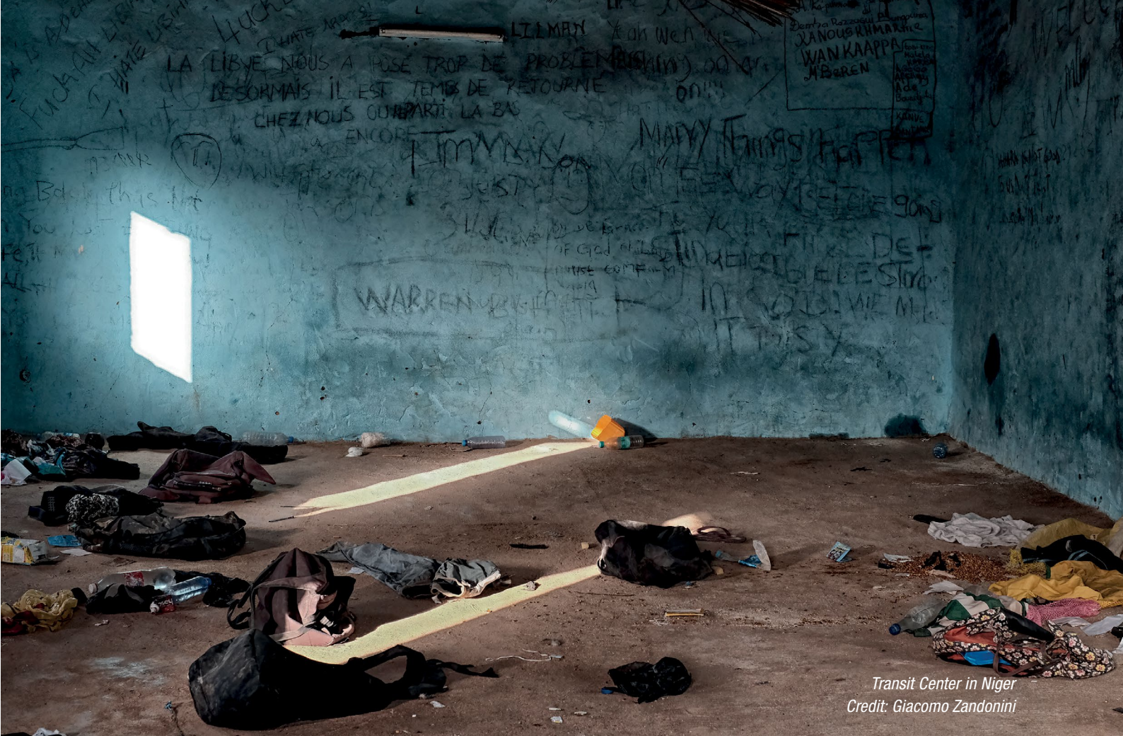
Transit Center in Niger

impression that things were moving on. I think it was a good idea to take a break and refine programmes”.