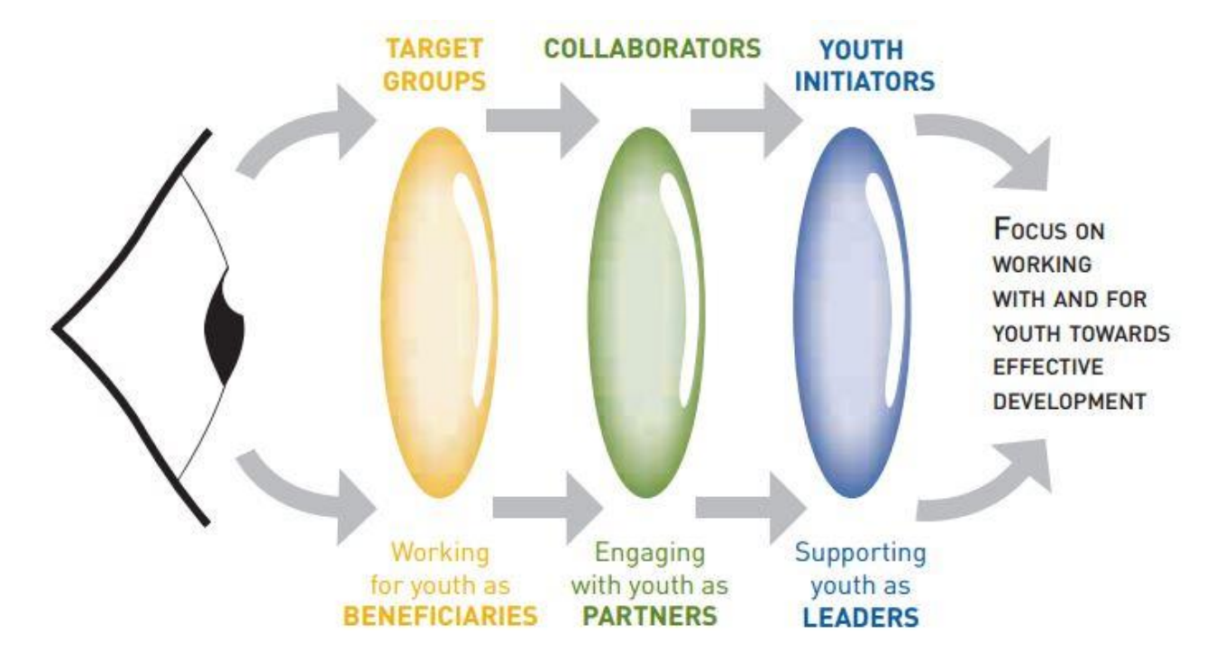
Figure 1: The 'lens' of participation for young people