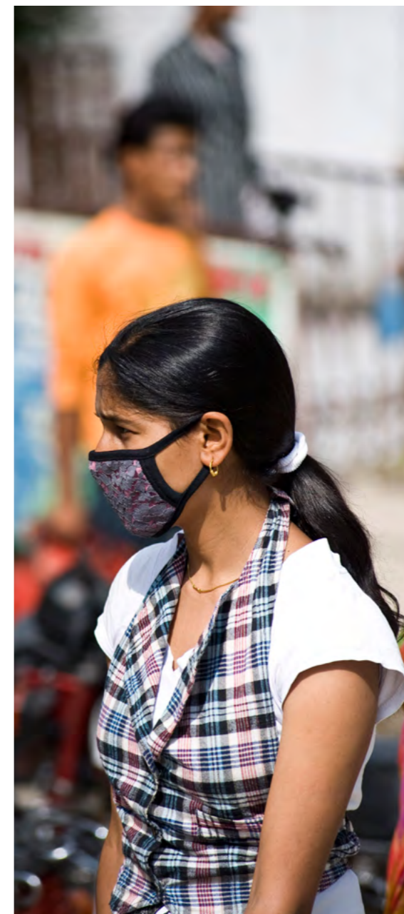
Pollution is a serious problem in Kathmandu, Nepal. The city lies in a valley and pollution often hangs over the city, affecting the population.

The framework should support substantially reducing water-related vulnerability to climate change, because it puts goals on poverty, health, economic growth, and potentially peace and security, at risk.