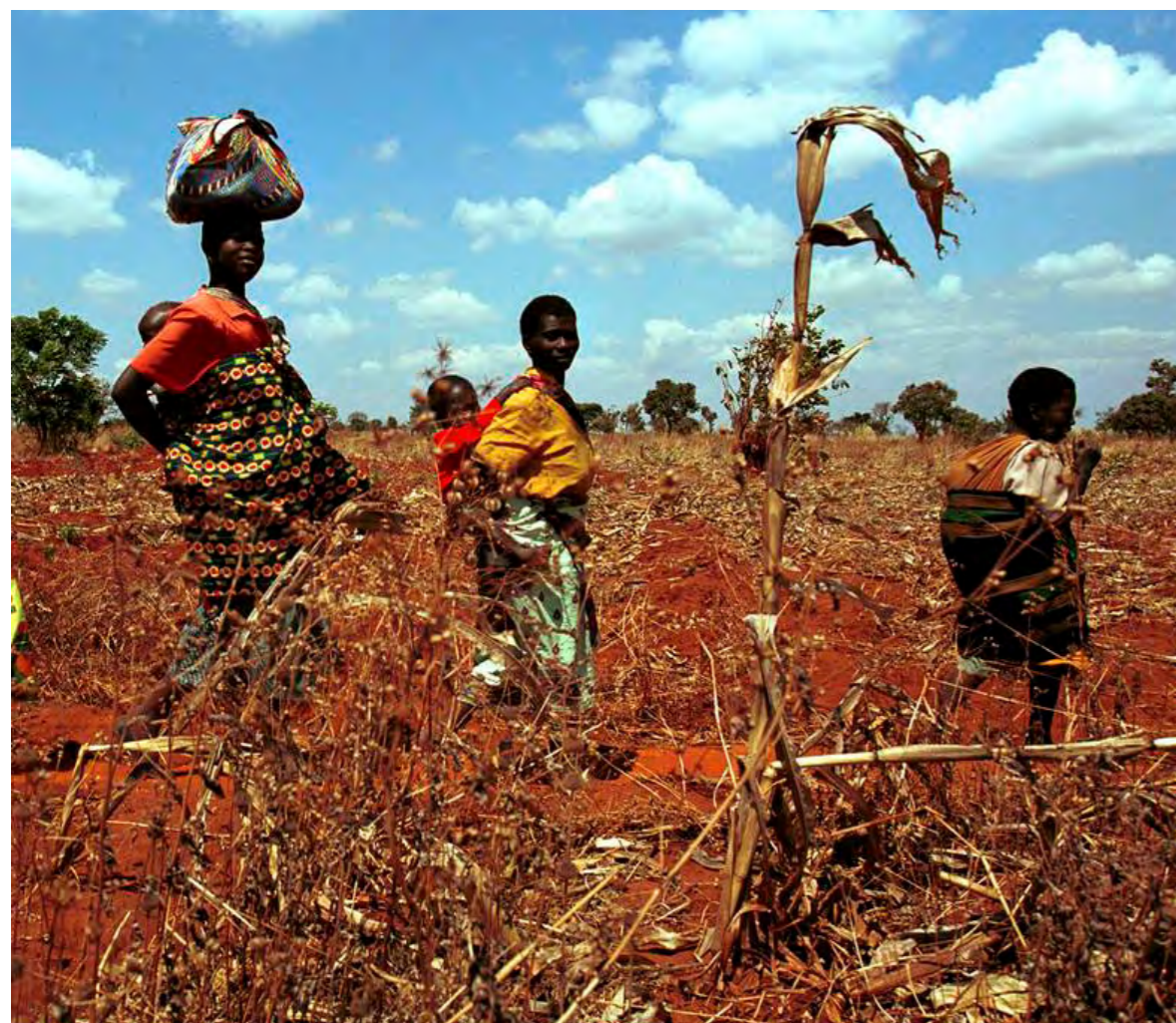
Women farmers walk through dry, barren fields, past remnants of their failed crops. This area of Malawi, although extremely poor, had been self-sufficient with food. Now communities suffer from malnutrition.

The Proposed SDGs from the OWG on terrestrial ecosystems (Goal 15) and on food security and agriculture (Goal 2) should tackle the impacts of forest degradation and agricultural practices on GHG emissions. When they are implemented well, activities to reduce deforestation can achieve co-benefits for several SDG areas, for example conserving biodiversity and water resources. Targets on agriculture should recognise how to reduce the sector's emissions through agro-ecological practices. Linked to SCP, demand-side measures such as diet changes and reducing losses in the food supply chain can also reduce emissions from food production.