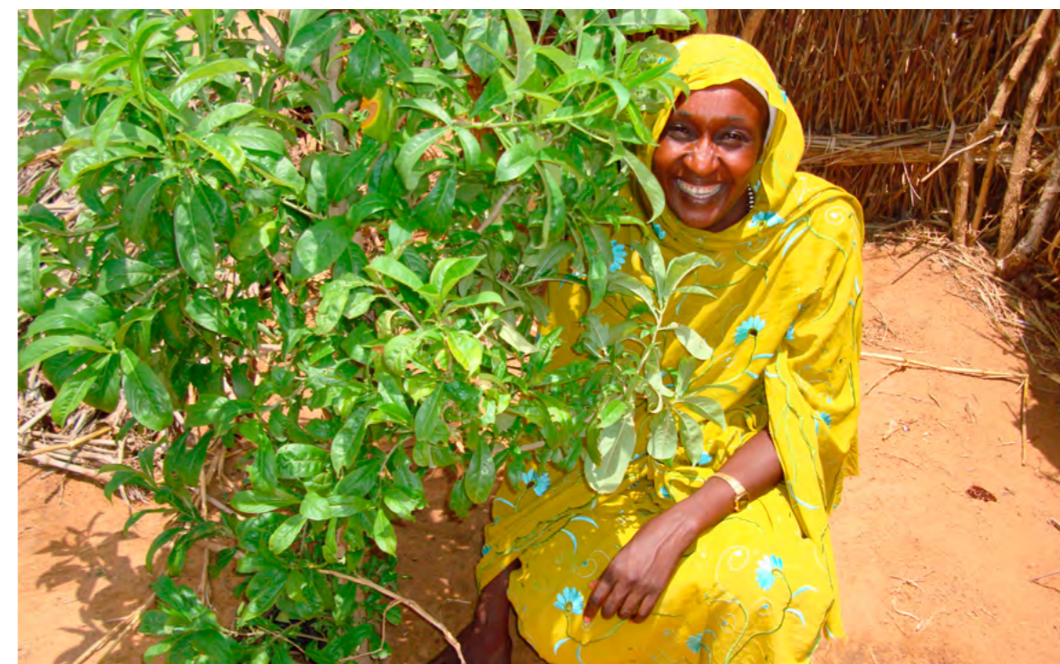
A member of the Darfur Women's Development Association with a sapling for the 'greening Darfur' project.

The Working Group III report outlines options for reducing GHG emissions and the likely impact of these. GHG emissions have been growing in almost all sectors over the last decade and are still on an upward path. While population growth has contributed to this, economic growth has been a much bigger driver. Emissions growth has outpaced improvements in energy intensity and, in recent years, increased use of coal has reversed a long-term trend towards decarbonising the world's energy supply. About half the emissions growth has come from the energy-supply sector, but industry (30%) and transport (11%) are also major contributors.