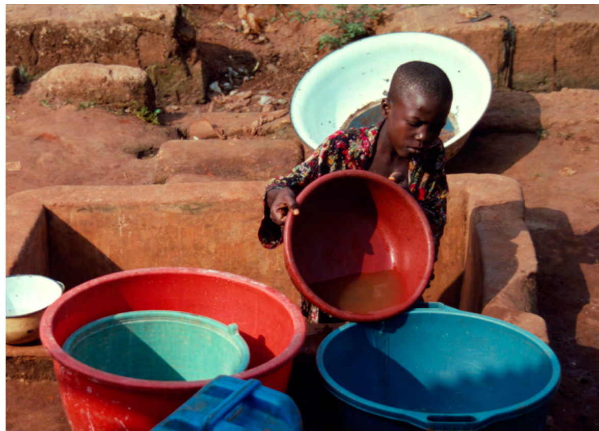
Water scarcity and lack of access to clean drinking water are common problems in Benin City and other urban centres in Nigeria.

Sea-level rises and more frequent and intense storms are increasing flood risk. They are projected to cause rising flood losses in the global South, and resettlements are already planned for some African and Asian river deltas. The potential scale of displacement, however, is beyond the capacities of many countries to adapt: small island states may become uninhabitable, while India and Indonesia are projected to experience an 80% and 60% increase, respectively, in the number of people