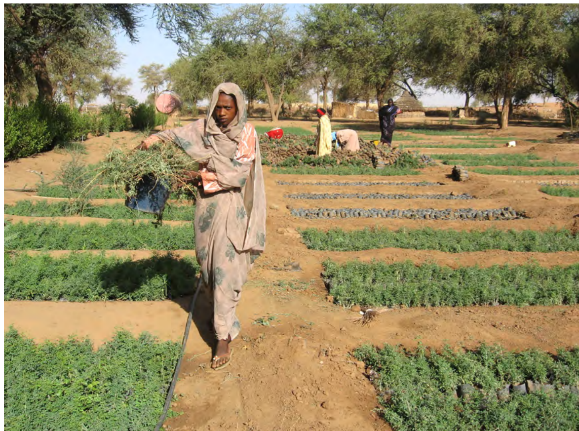
A woman working in a tree nursery in Northern Darfur, Sudan - an area affected by conflict and drought. The nursery is part of a natural resource management project.

However, the multiple impacts that climate change can have on the poor and most vulnerable will increase up to and beyond 2030 unless ambitious action to reduce climate risk and vulnerability is taken across all goal areas. Beyond 2030, the scale of the impacts will be determined by whether global emissions cuts happen at a speed and scale fast enough to avoid further temperature rises (see the 'Low carbon development' section, below).