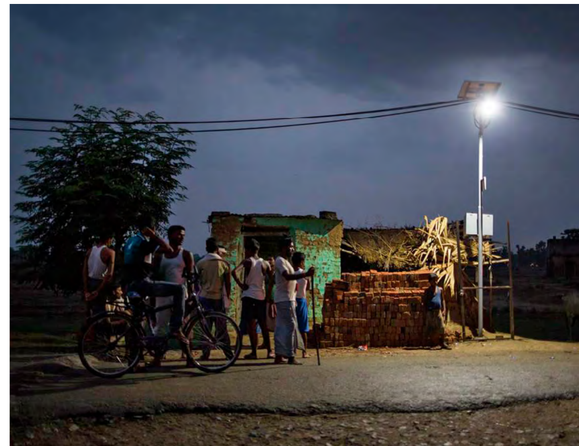
The development of a solar-powered micro-grid electrifies the entire village of Dharnai, Biha, India. It powers around 400 households and 50 commercial establishments around the clock.

The current proposed goals from the OWG do not expressly recognise the role that the transport sector plays in driving climate change risk or the immediate public health benefits of shifting to low carbon transport systems. A shift to low carbon public transport infrastructure should be incentivised. As with energy, the impact that the proposed SDG to promote economic growth will have on increasing transport sector emissions should also be addressed.