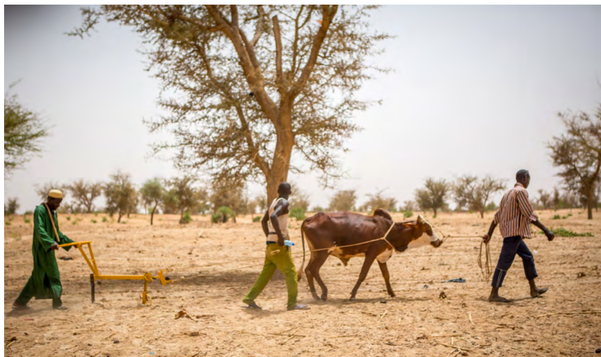
Every year, the changing climate brings less rain to Dogondoutchi, Niger, and greater challenges. Most of the farming, on the hard land, is done by hand and takes many hours. Now the farmers have been given ploughs, to increase farming and allow more time for other activities.

The target in the OWG proposal on integrating climate-change measures into national policies, strategies and planning, has the potential to support mitigation as well as adaptation action, but the suggested target is currently too vague. The target on strengthening resilience and capacity is a top priority for poverty eradication, but the target needs to be strong enough to lead to firm action. The goal could be further enhanced with targets that incentivise mitigation action across all sectors, in support of the mitigation action to be agreed under the UNFCCC ongoing negotiations.