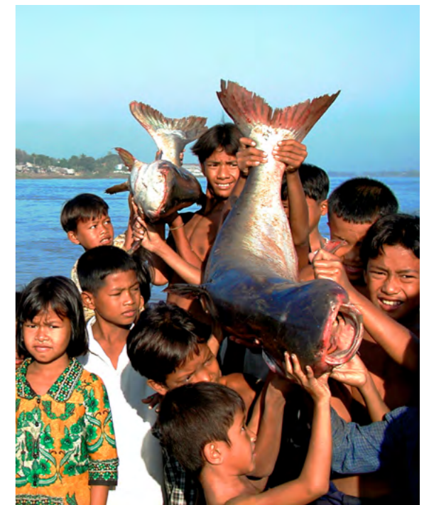
River catfish and Mekong giant catfish are harvested when they migrate from lake to river at the end of the rainy season. The Mekong giant catfish occurs naturally only in the Mekong basin, Cambodia, and it is critically endangered.

Coastal and ocean systems are also being affected, through sea-level rise, increased storm surges, flooding, and ocean acidification. Warming ocean temperatures and ocean