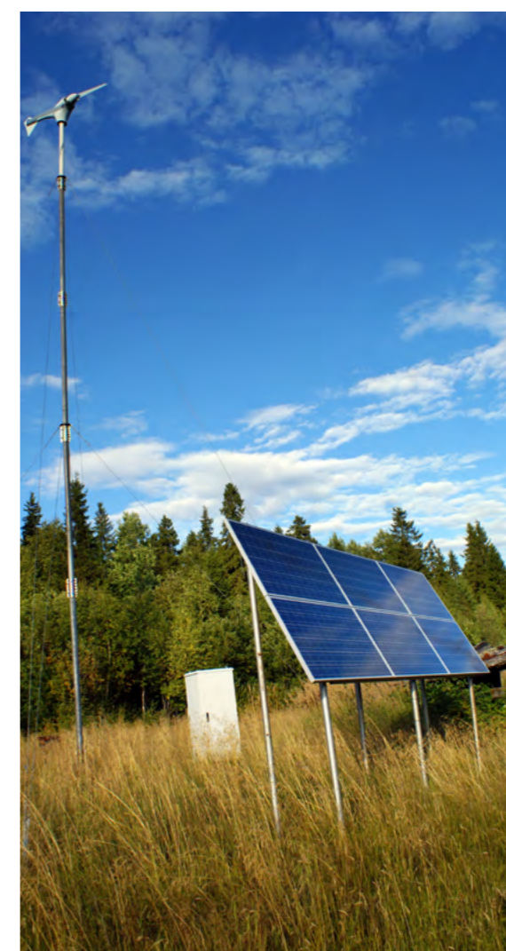
A solar panel in the Vodlozerskiy national park, Karelia region, Russian Federation.

Shifting to renewable energy offers co-benefits that are crucial to success in several SDG goal areas. These include reducing outdoor and indoor air pollution, which will improve health outcomes and lower the incidence of respiratory disease. This is particularly pertinent to women and children’s health in poorer countries. Provision of more sustainable and efficient