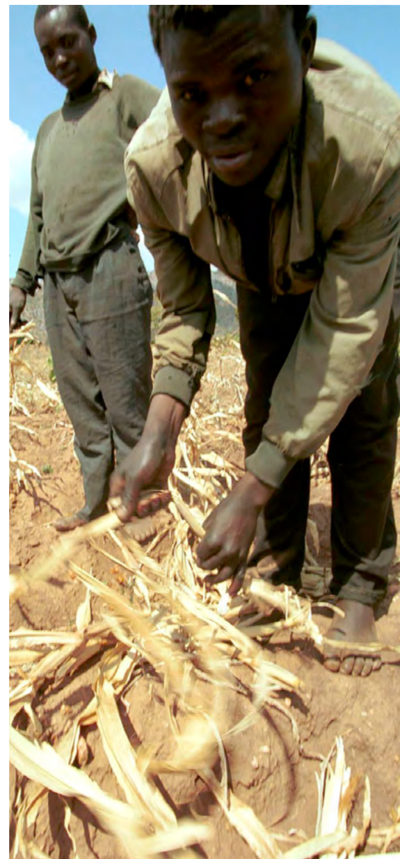
In Malawi, farmers from Nkana Khoti Village show their destroyed maize crop. Severe drought in the region leads to malnutrition and widespread hunger.

impacts already 'locked-in' by past emissions, will depend on the development pathways that countries take now. There is increased need to address the loss and damage that emission mitigation and adaptation measures can no longer remedy. Critically for the SDGs, global development over the next 15 years is likely to determine whether we can cut emissions fast enough to avoid catastrophic climate change later this century. Urgent action is required to achieve a peak and decline of emissions before 2020.