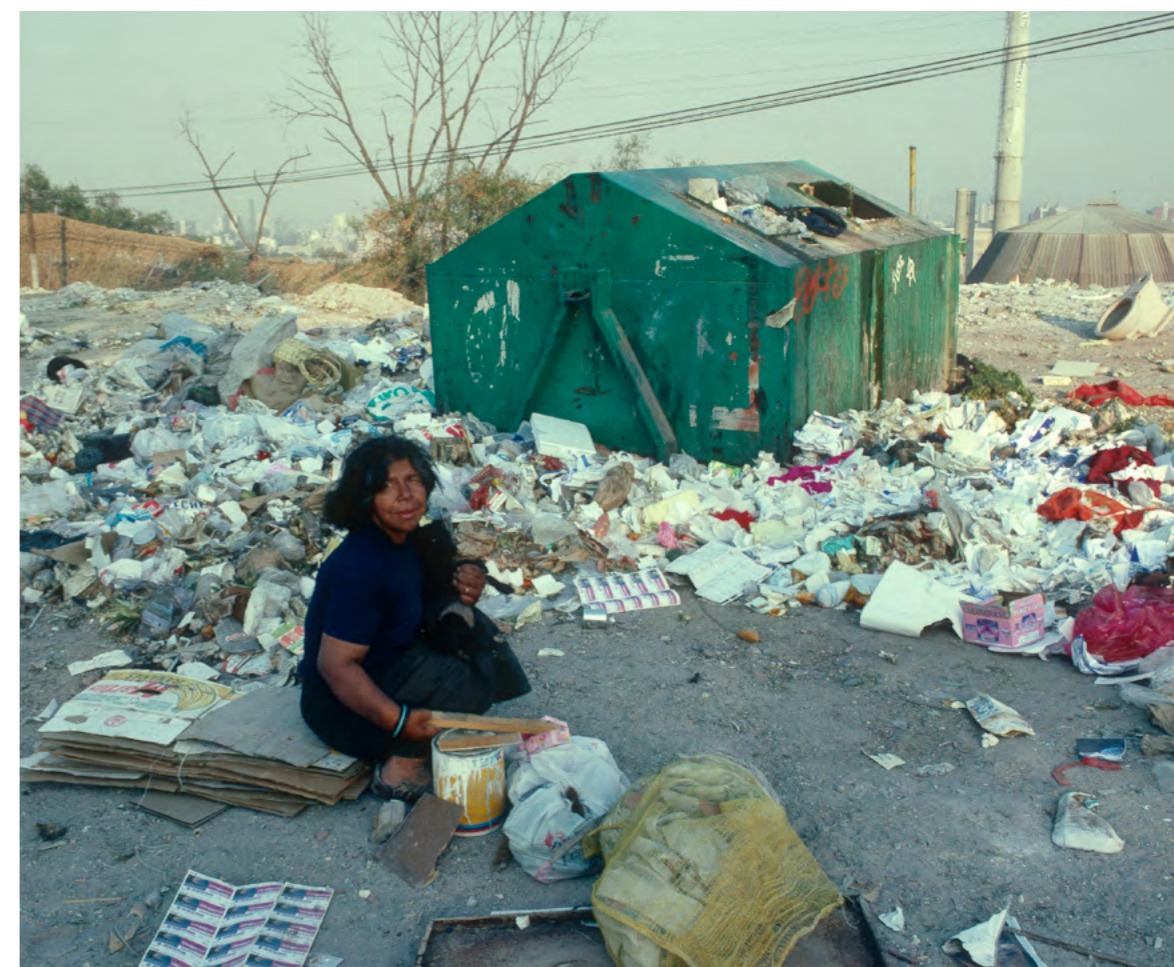
A small refuse tip at Polvora, on the west fringe of Mexico City, Mexico.

The OWG’s proposed Goal 12 – to ‘ensure sustainable consumption and production patterns’ – needs to expressly address the role that unsustainable consumption and production in richer societies plays in driving climate change, which impacts most on poor and vulnerable groups.