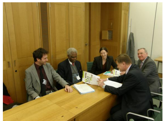
Beyond 2015 presents to the International Development Committee, UK parliament (March 2011)

In 2011, building from the campaign's original strong base of participating organisations in the UK, Beyond 2015 undertook a number of lobbying activities with UK Parliamentarians and with the UK Department for International Development. The UK Secretary of State, Andrew Mitchell has dramatically shifted his position, and is now very open to discussing post-2015.