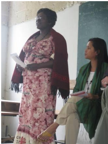
Beyond 2015 workshop at the World Social Forum in Dakar, Senegal (March 2011)

Strategic Aim 2011: Beyond 2015 is officially discussed at the UN level (focus on the Secretary General's Annual Report on the MDGs, Rio+20 and any working groups established by the UN).