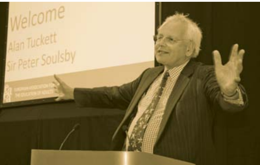
The EAEA Grundtvig Award 2013 Ceremony was hosted by Mr Alan Tuckett, the President of the International Council for Adult Education (ICAE).

In 2013, EAEA was looking for projects that tackle a specific aspect of civic learning: Active citizenship and transnational solidarity – Adult Education as a tool against nationalism, chauvinism and xenophobia . 2013 was the European Year of Citizens and we, as adult educators, saw this as a platform to promote and discuss civic education and active citizenship.