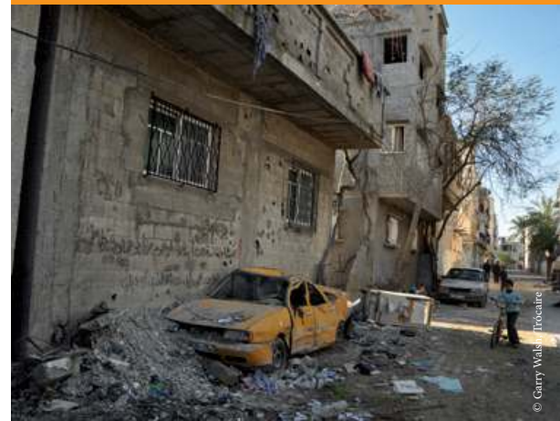
Gaza residential area affected by the November 2012 aerial bombings

Given the EU's commitments to promote respect for international humanitarian and human rights law, as well as its influence as a major donor to the Palestinians and trading partner of Israel, there is still a range of actions it could take to address violations on the ground.