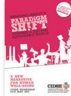
Bringing about a paradigm shift: Towards a just and sustainable world - a new narrative for human well-being Interactive report of CIDSE workshop

Please visit www.cidse.org for a full overview of other 2013 documents, including statements, recommendations and leaflets.