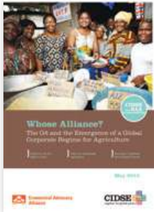
Whose Alliance? The G8 and the emergence of a global corporate regime for agriculture CIDSE and EAA recommendations

CIDSE has a strong tradition of publishing policy papers, reports and statements which are highly valued by decision and policy makers and journalists alike, as well as those within the CIDSE network and the wider development community. The following are a few key publications from last year: