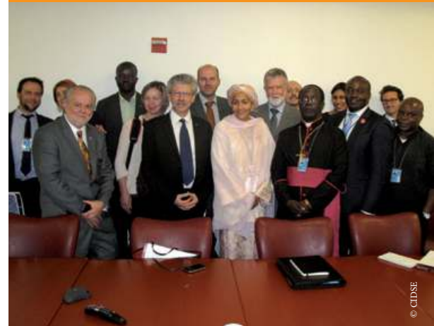
Delegates with Anima Mohammed, UN Special Advisor on Post-2015 Development Planning

Time and time again CIDSE has stressed that human dignity and respect for human rights must be central to future goals and that they need to address the structures of our financial system as well as climate change. Our delegations to the UN and EU and our work at the World Social Forum have reinforced the voices of our Southern partners, and “sustainable development” is, today, at the heart of all the thematic areas we are engaged in. Current political discussions on a new post-2015 framework and SDGs, as well as growing awareness that business-as-usual is not working, give us the chance to promote our vision.