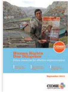
Human Rights Due Diligence: Policy measures for effective implementation CIDSE recommendations